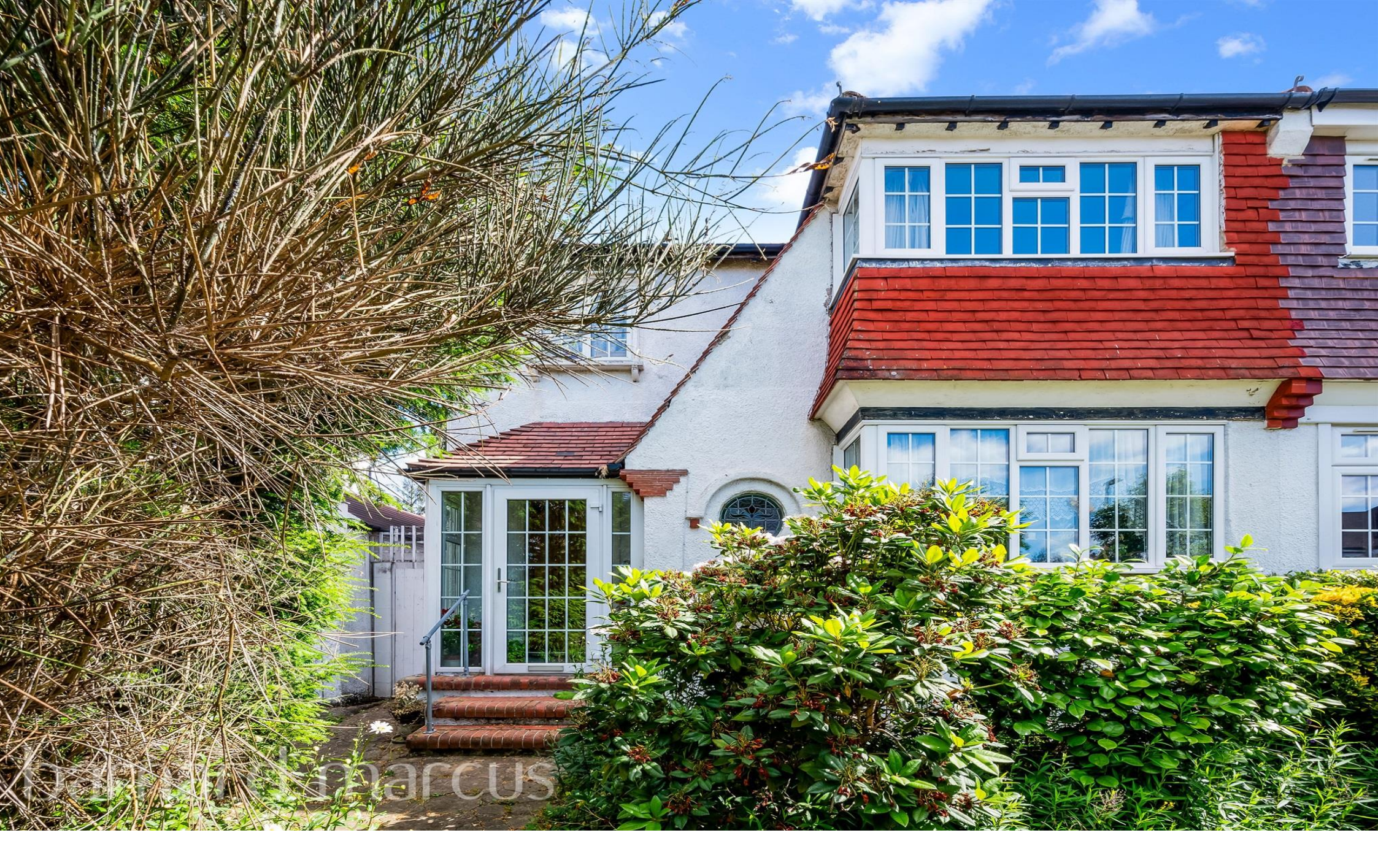
The Chase, London SW16 3AE