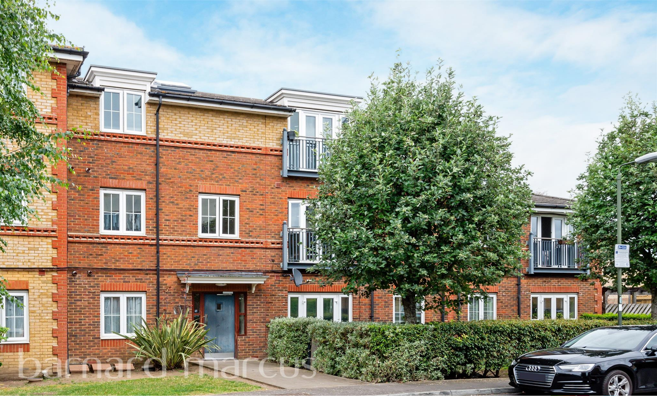
Medlar House Hemlock Close, London SW16 5PS