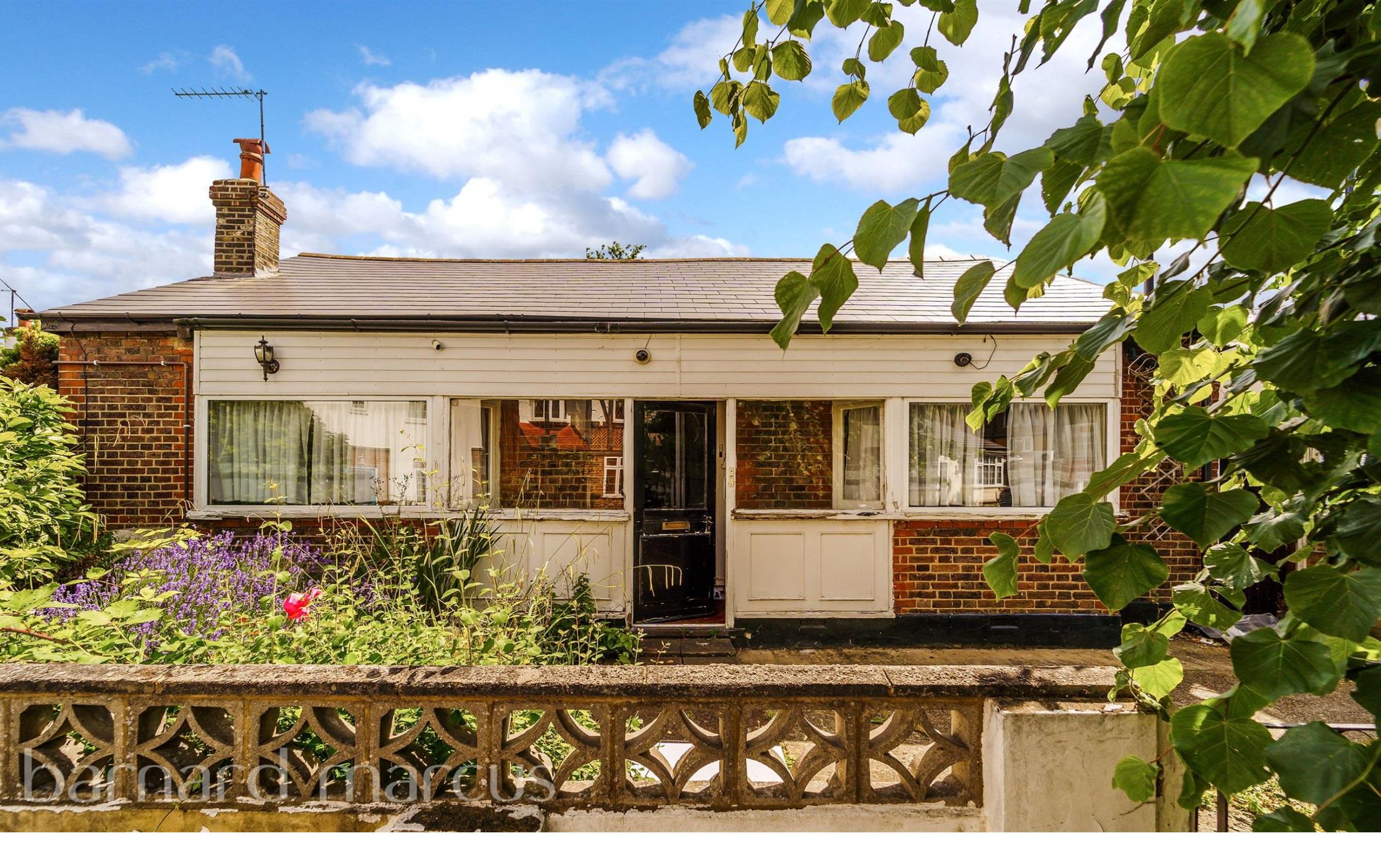
The Bungalows, London SW16 6PA