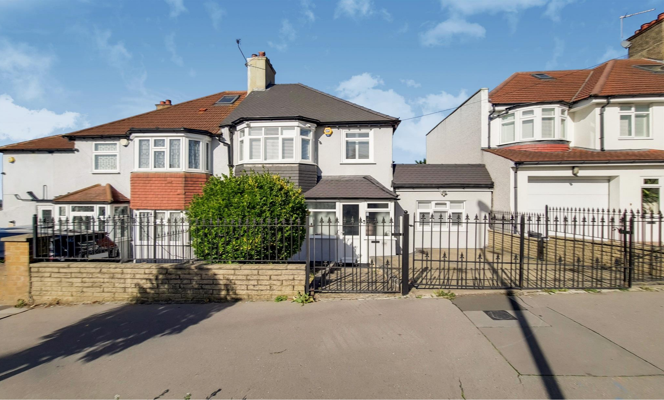
Norbury Hill, London SW16 3RU