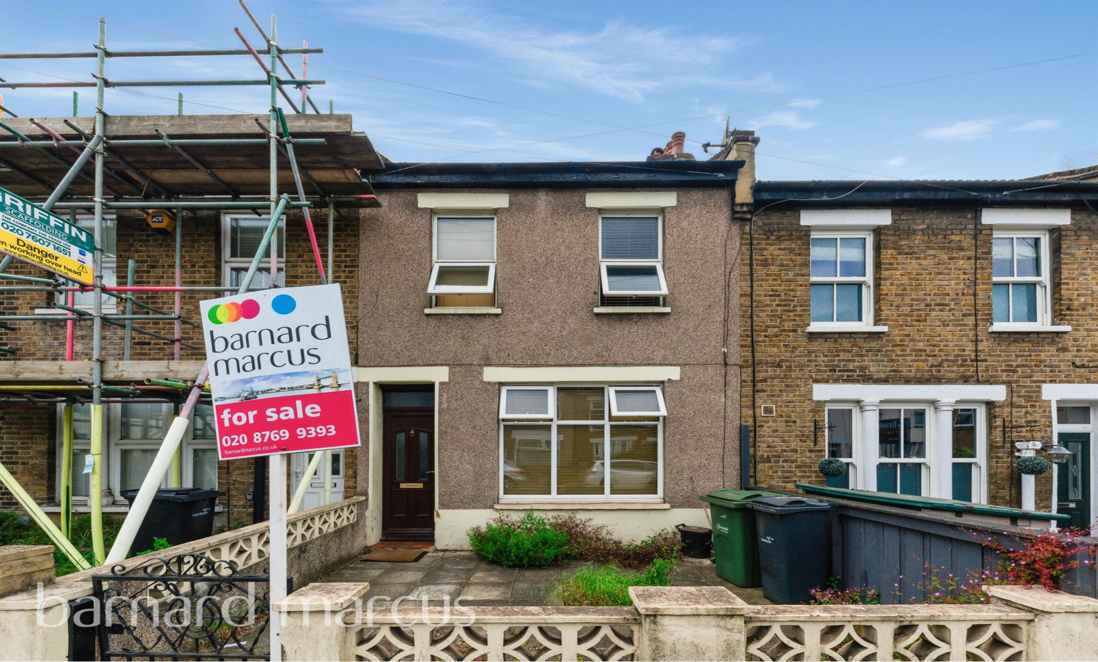
Eardley Road, London SW16 5TG