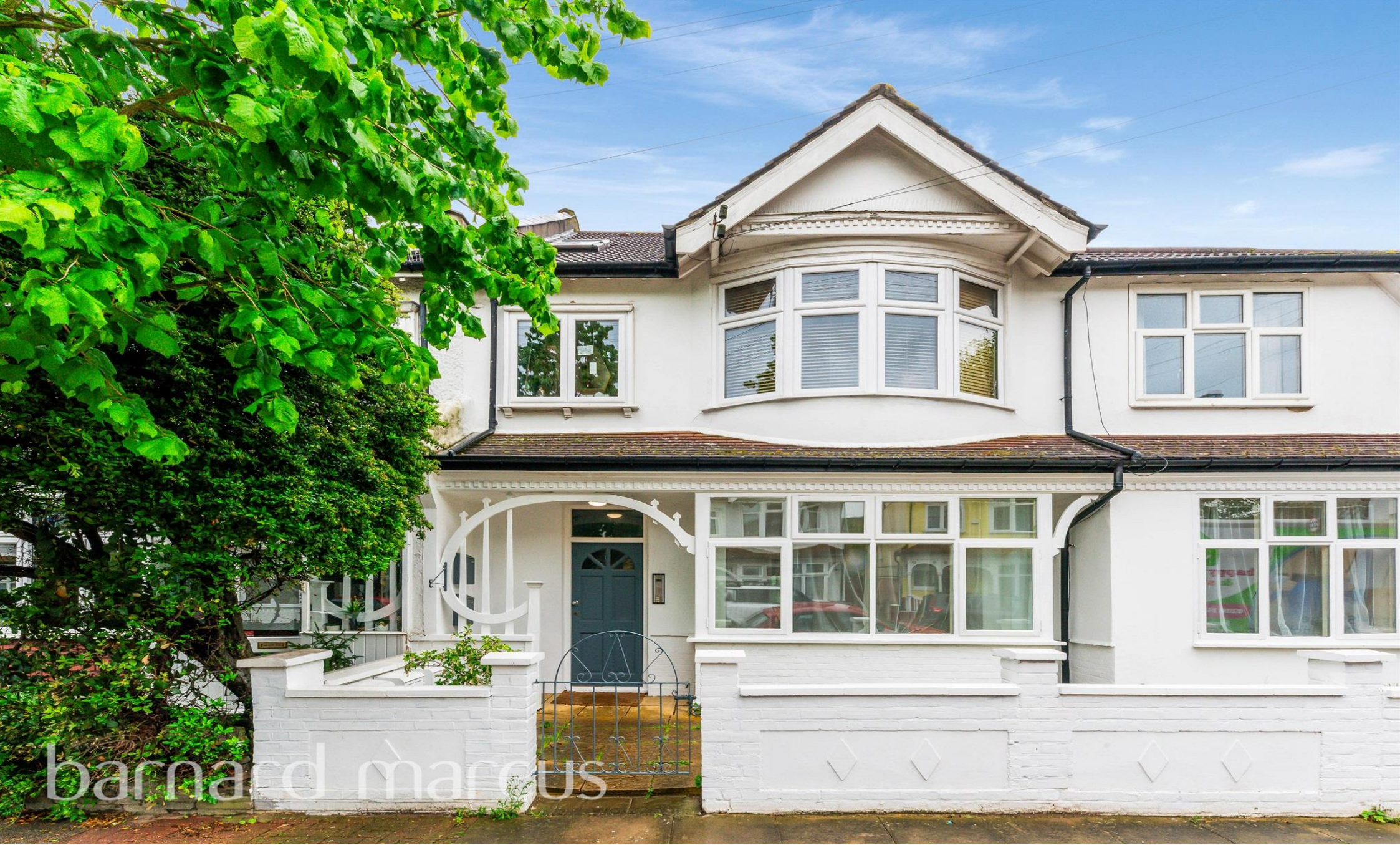
Woodnook Road, London SW16 6TZ