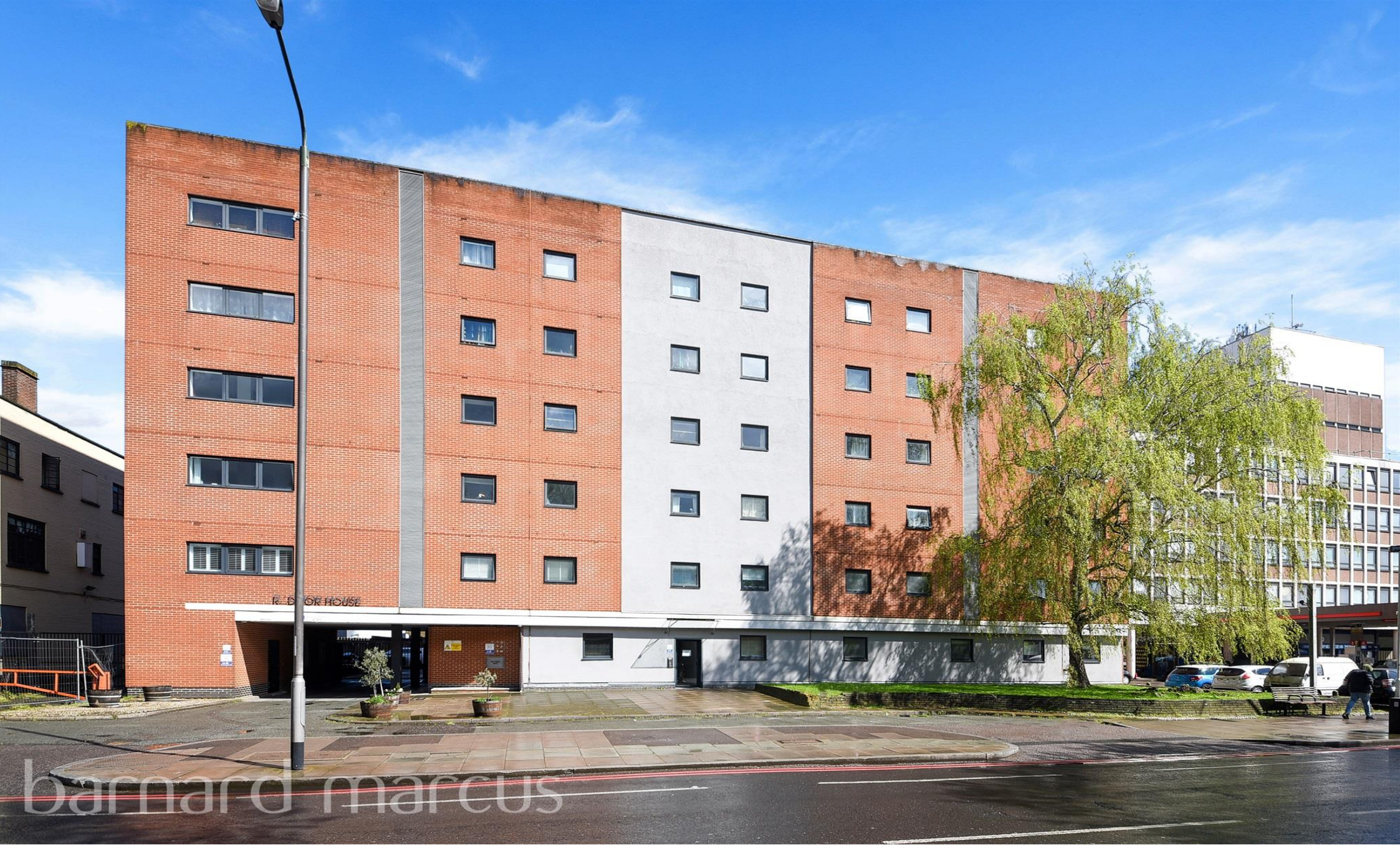
Radnor House London Road, London SW16 4EA