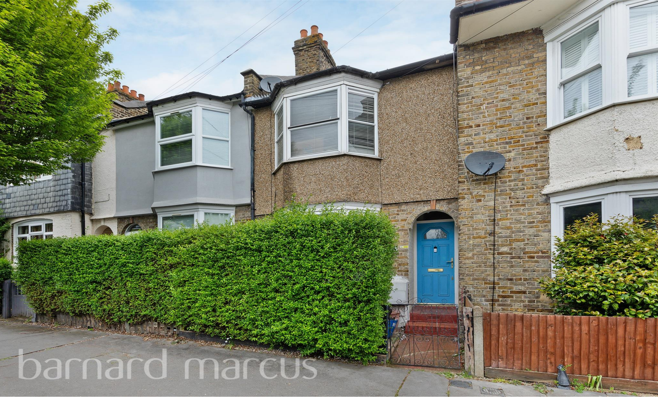
Northborough Road, London SW16 4AY