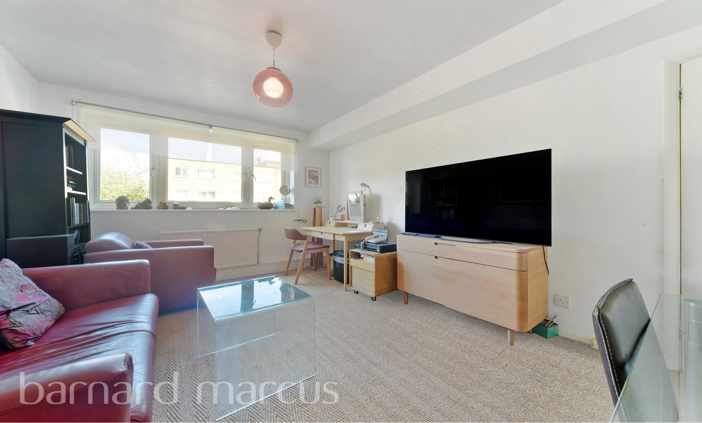
The Alders, London SW16 1TP