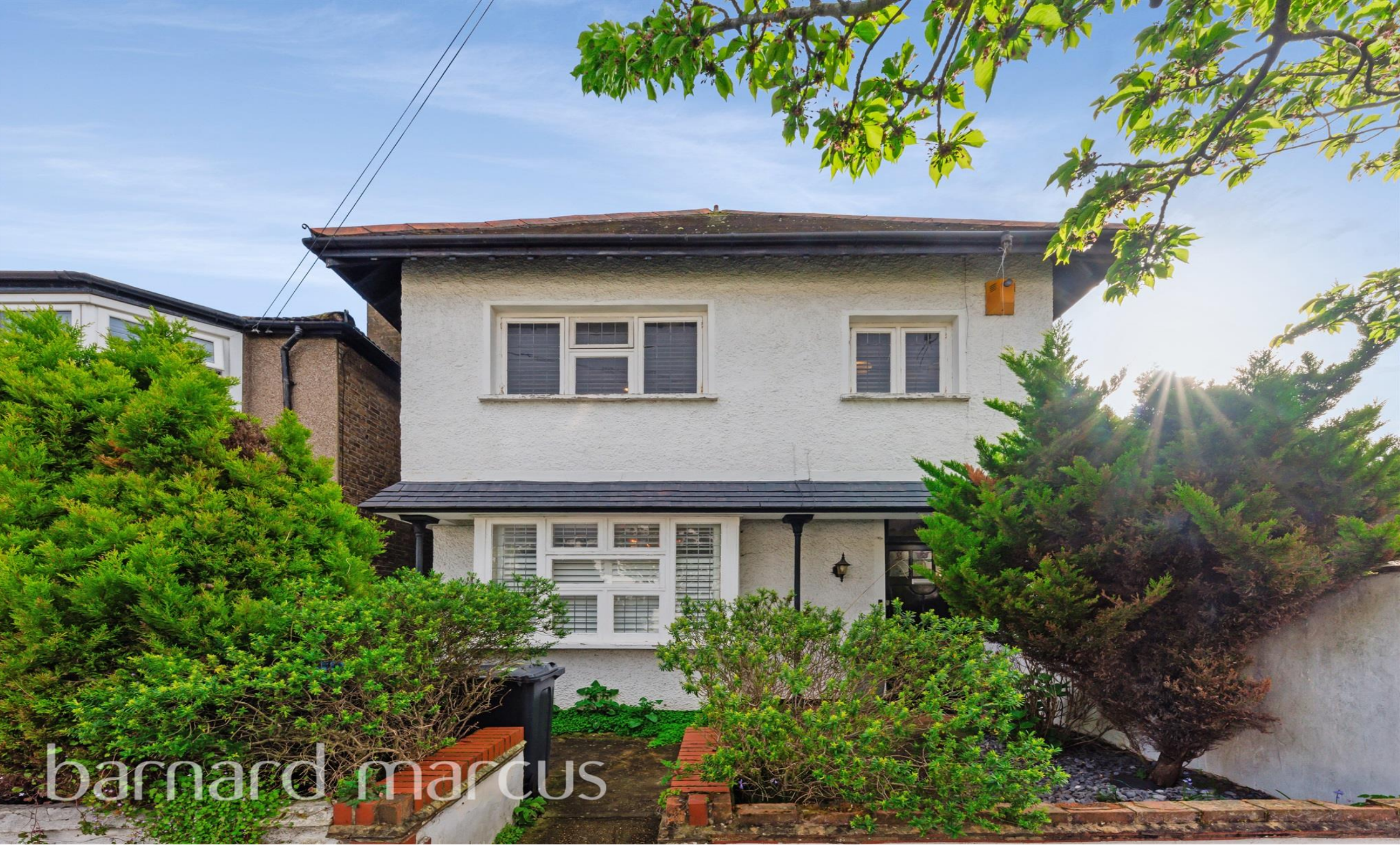
Beech Road, London SW16 4NW