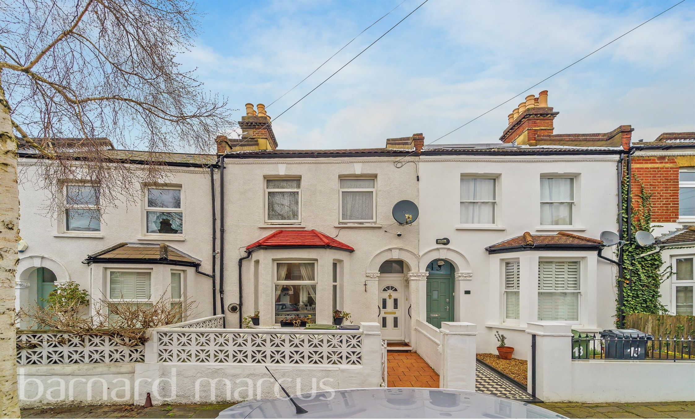
Ferrers Road, London SW16 6JQ