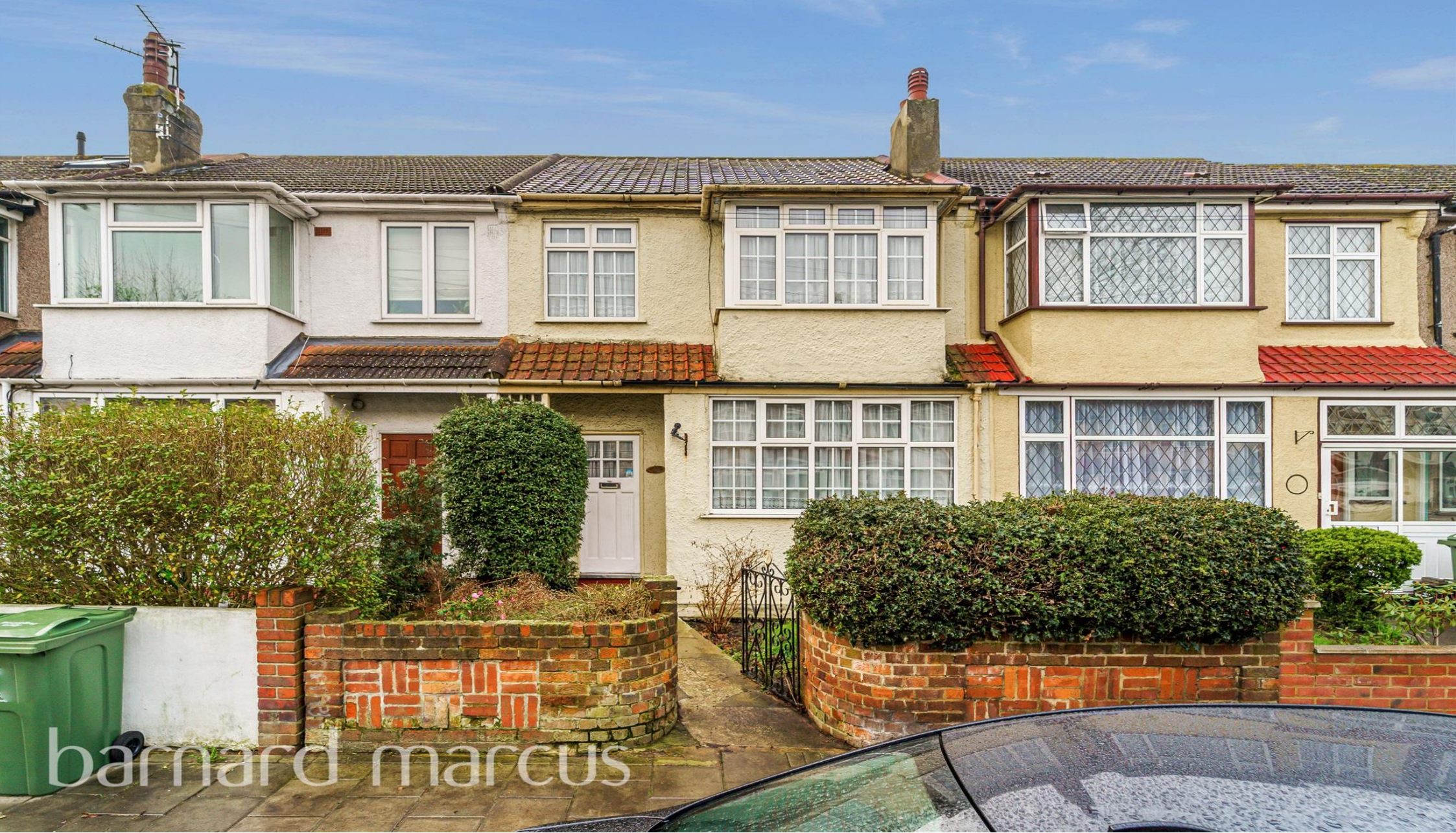
Farmhouse Road, London SW16 5BQ