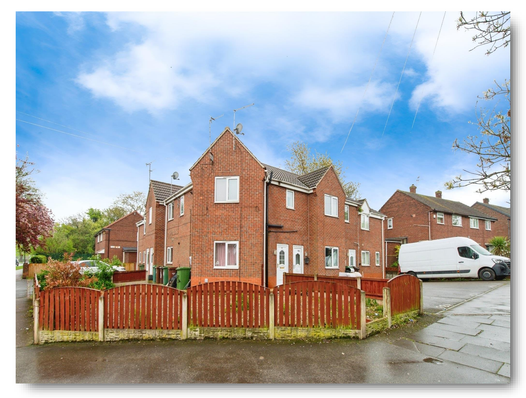
96b Elizabeth Drive, CASTLEFORD WF10 3RW