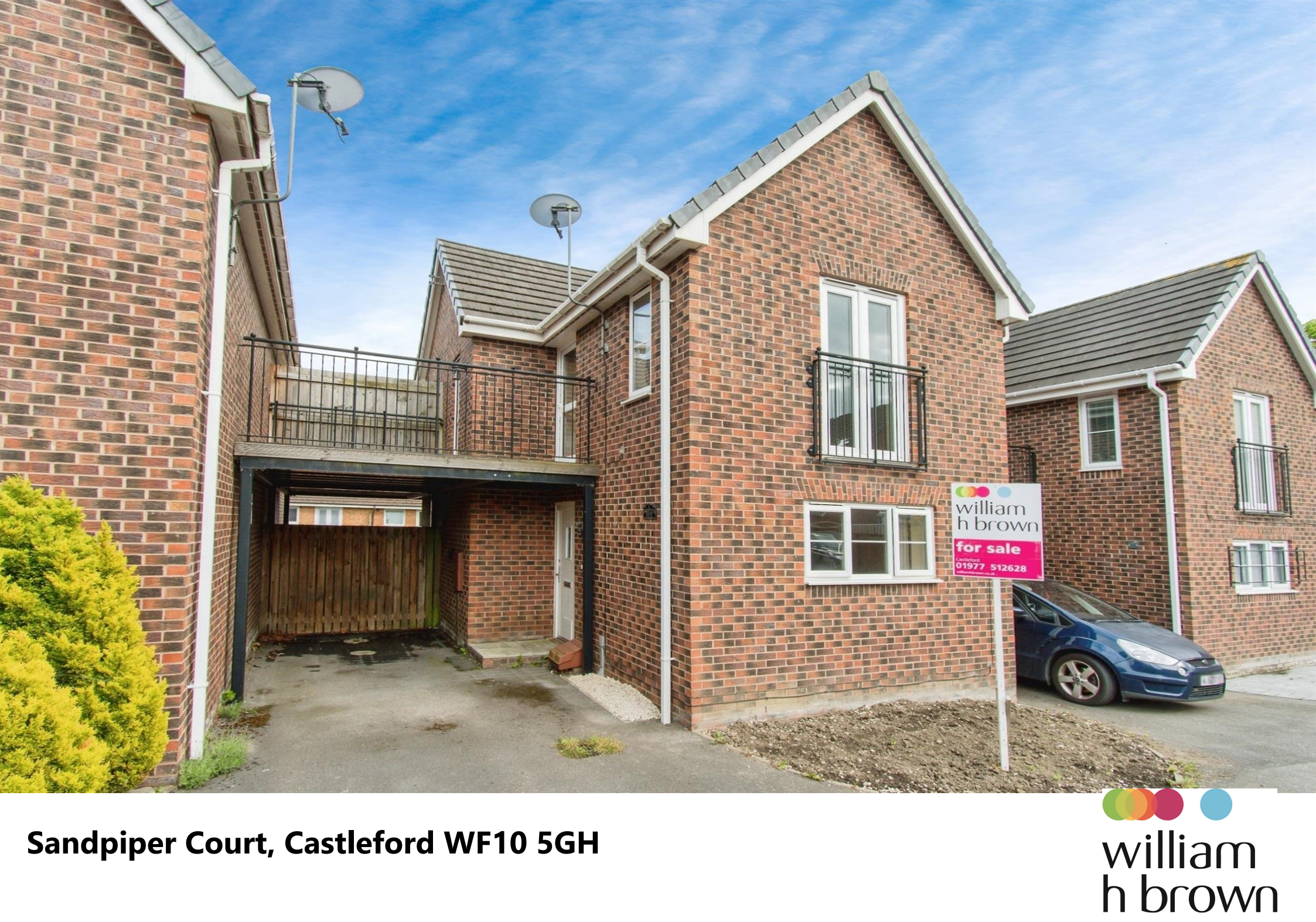
Sandpiper Court, Castleford WF10 5GH