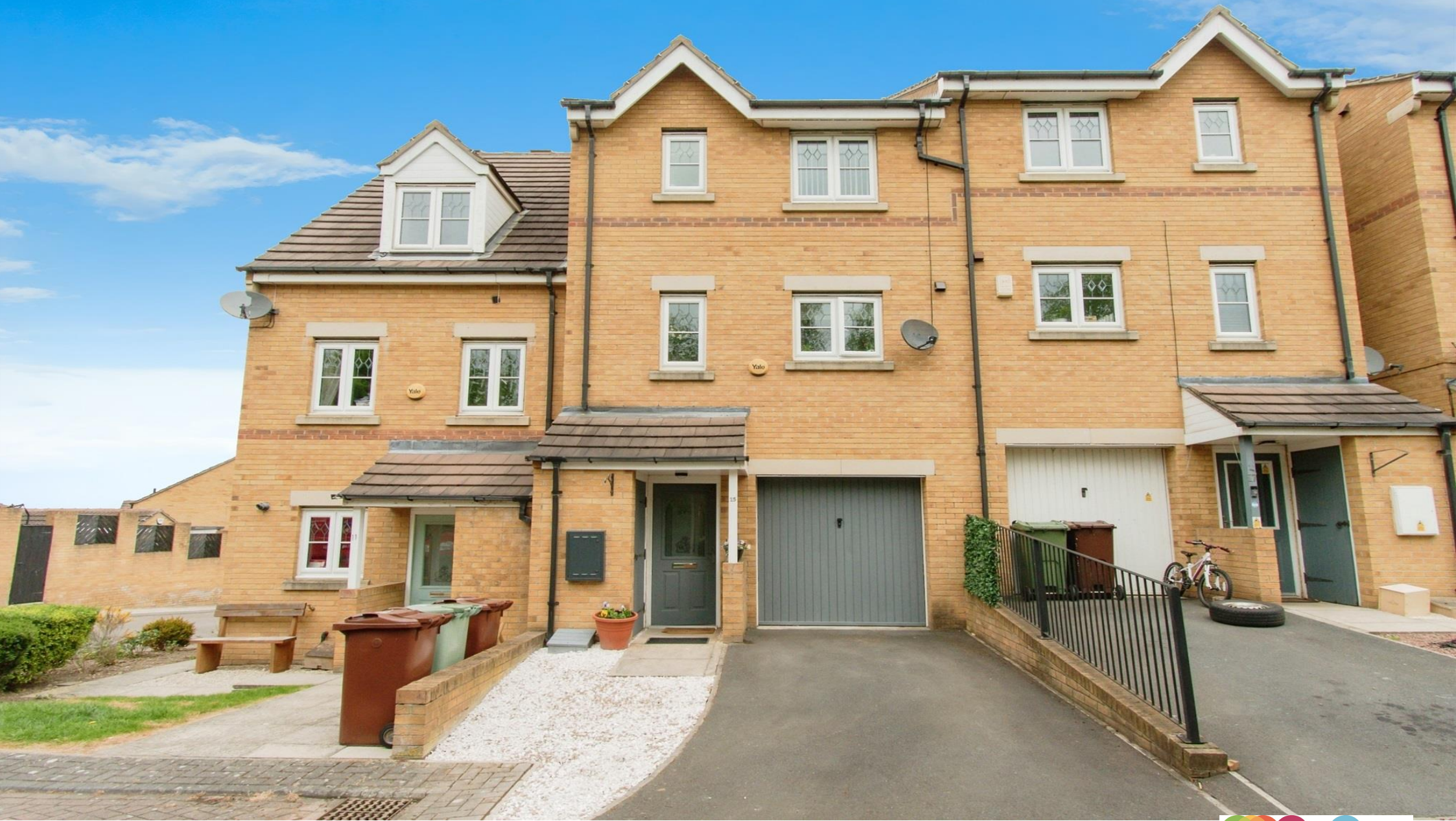
Jasmine Gardens, Castleford WF10 5UE