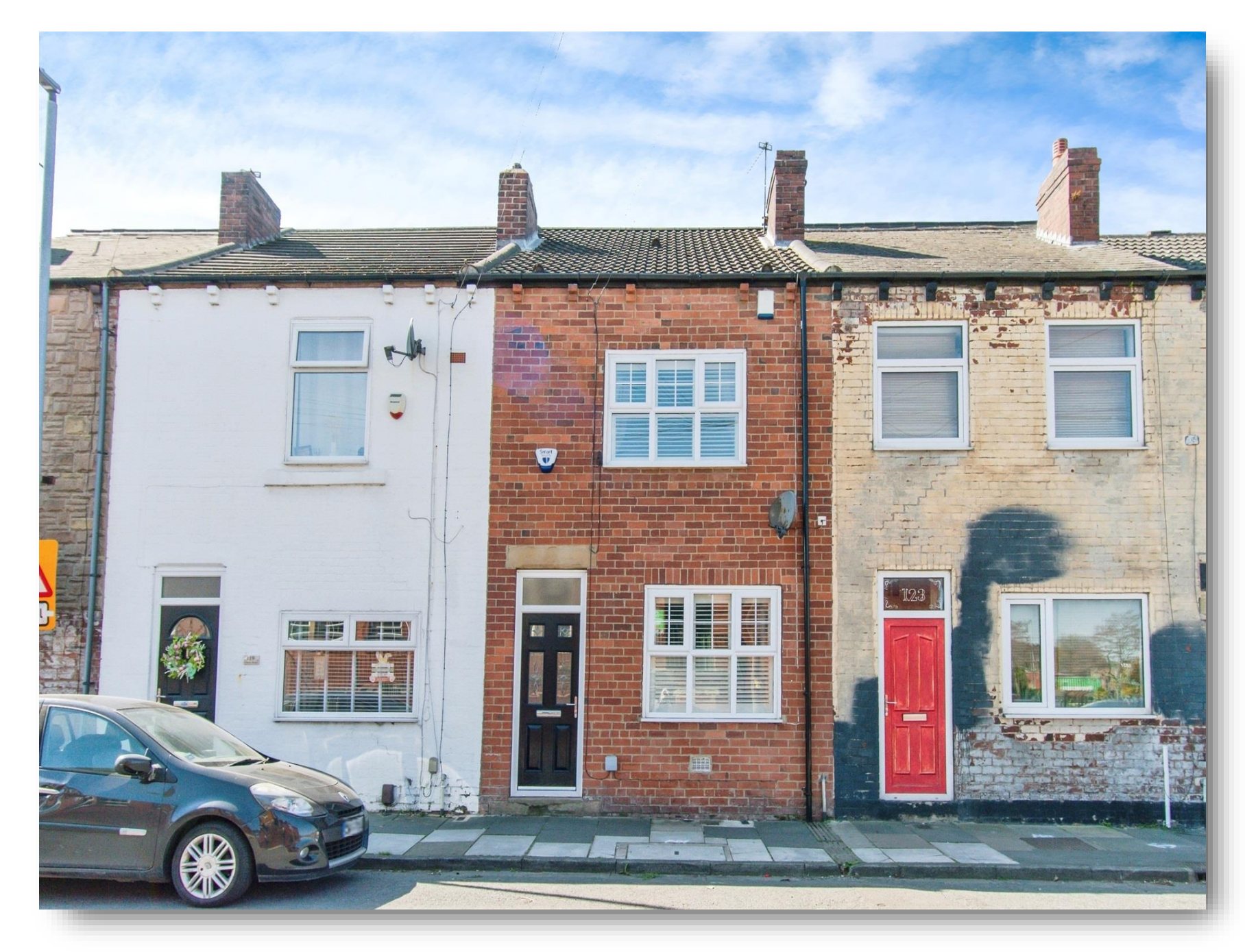
Ashton Road, Castleford WF10 5AX