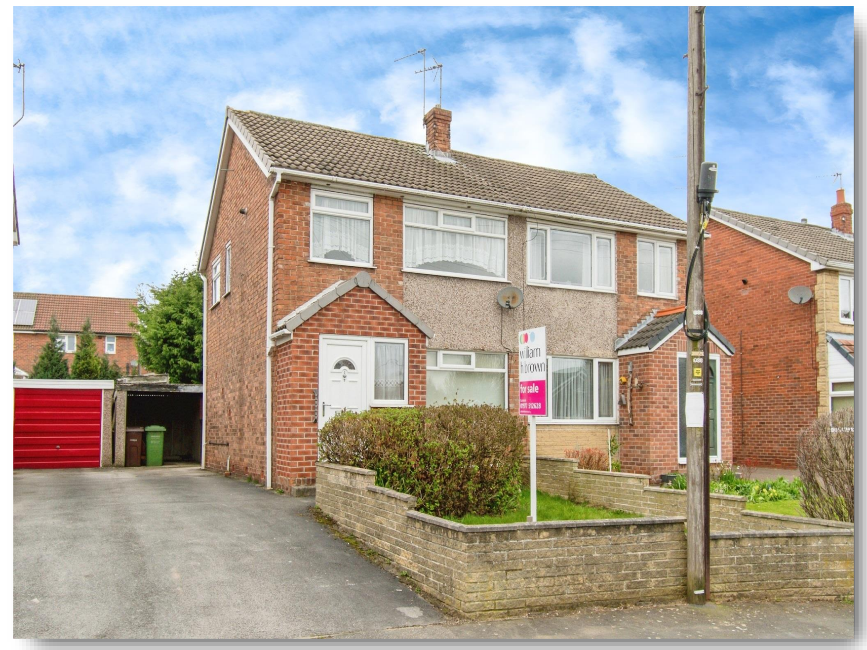
Sussex Crescent, Castleford WF10 3NX