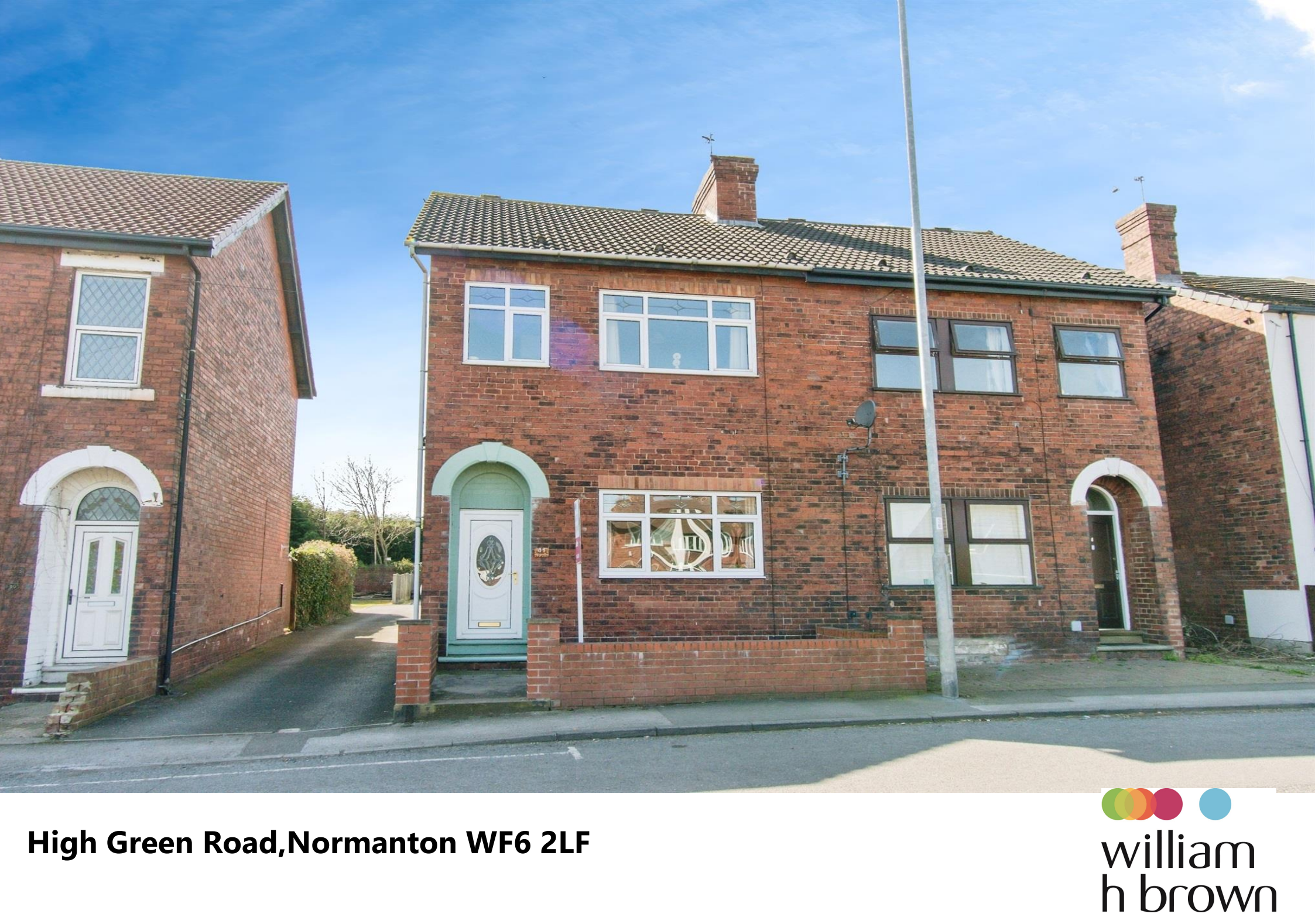
High Green Road, Normanton WF6 2LF