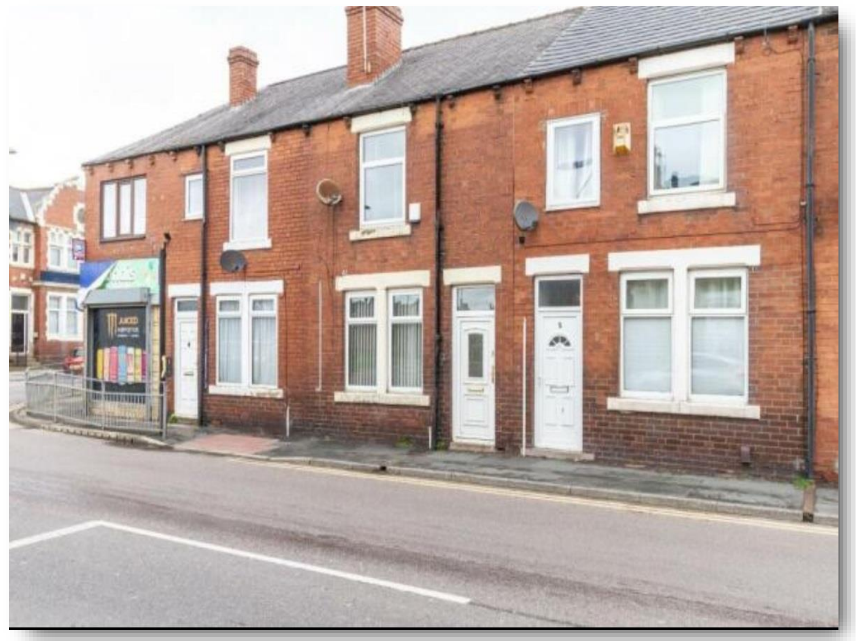
Leeds Road, Cutsyke Castleford WF10 5HH