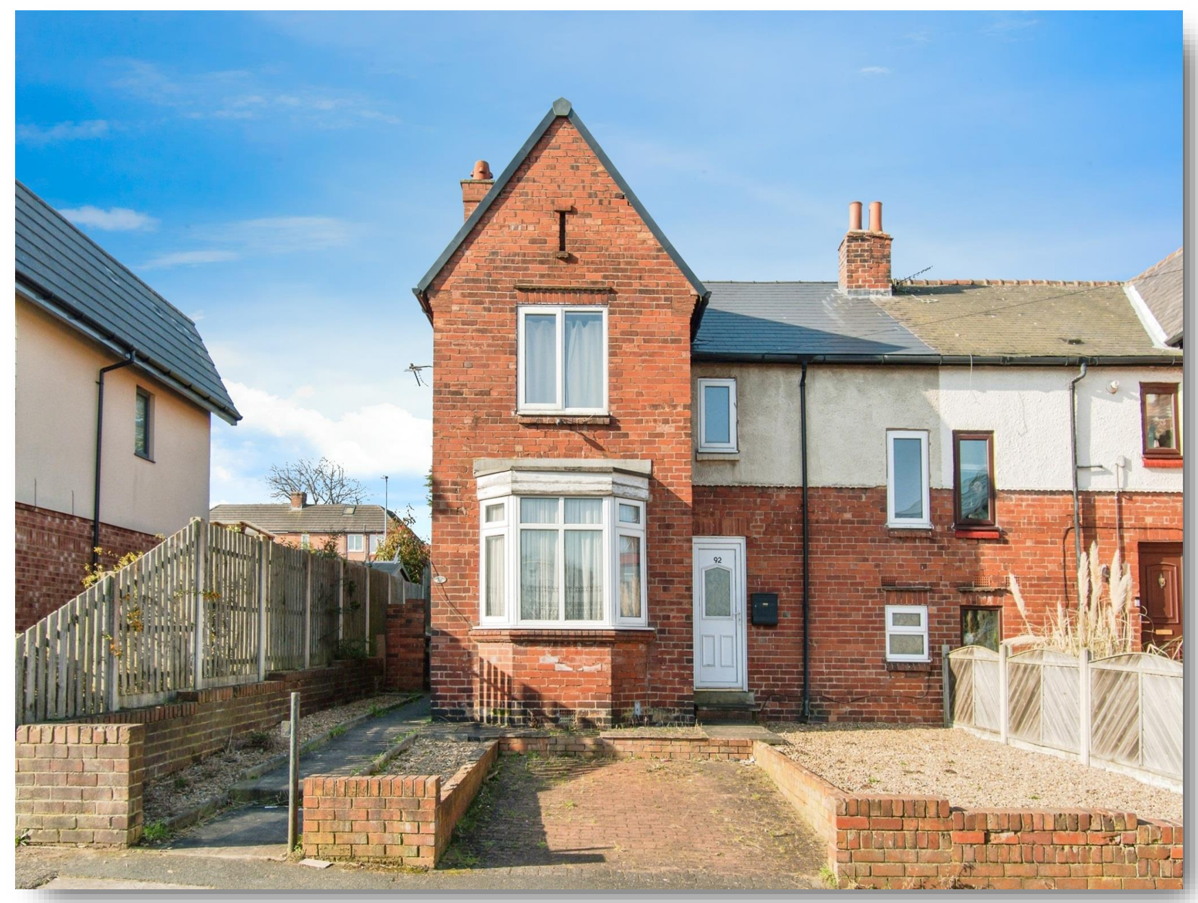
Park Dale, Castleford WF10 2QR