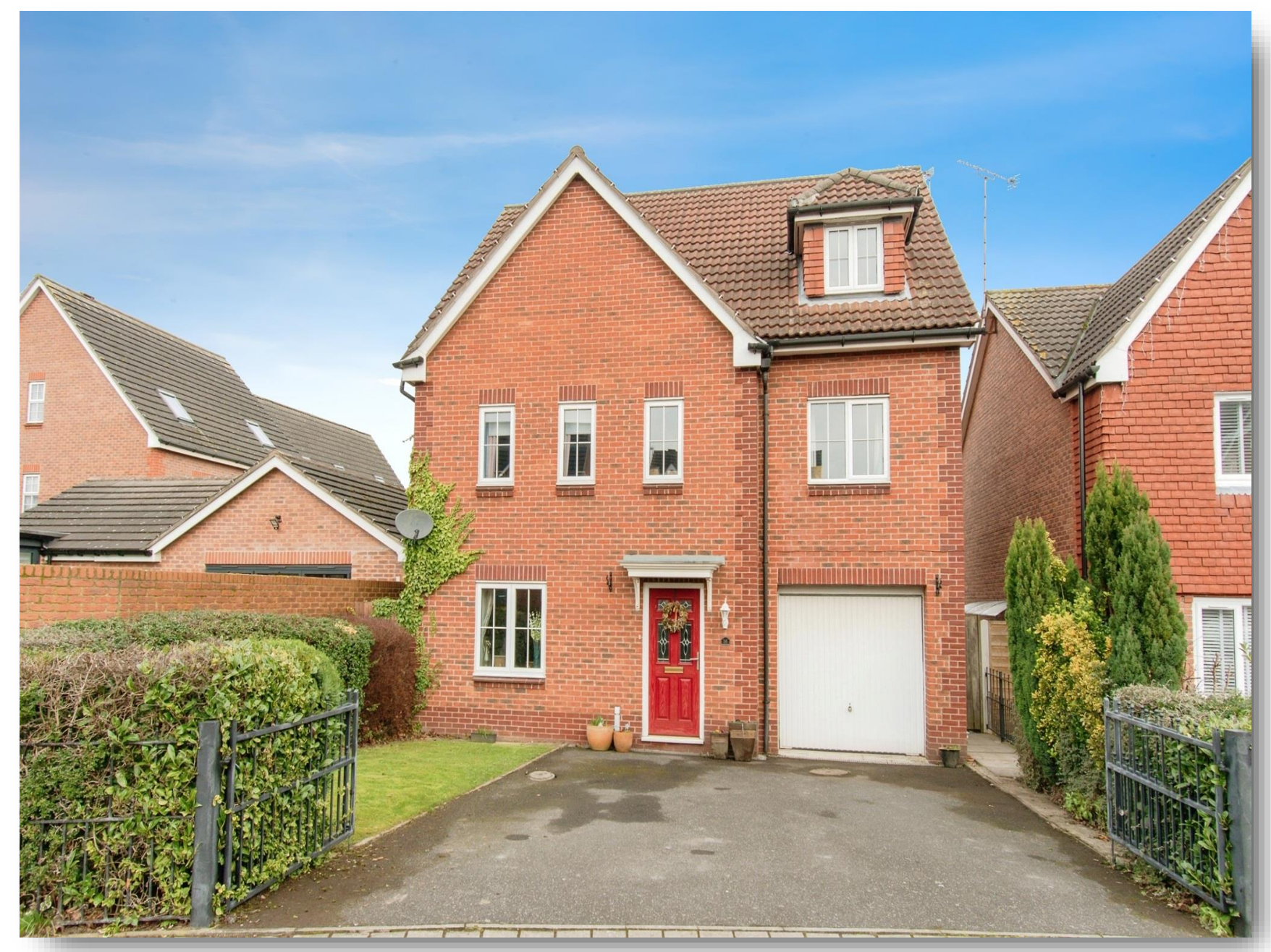
Royal Birkdale Way, NORMANTON WF6 1WH