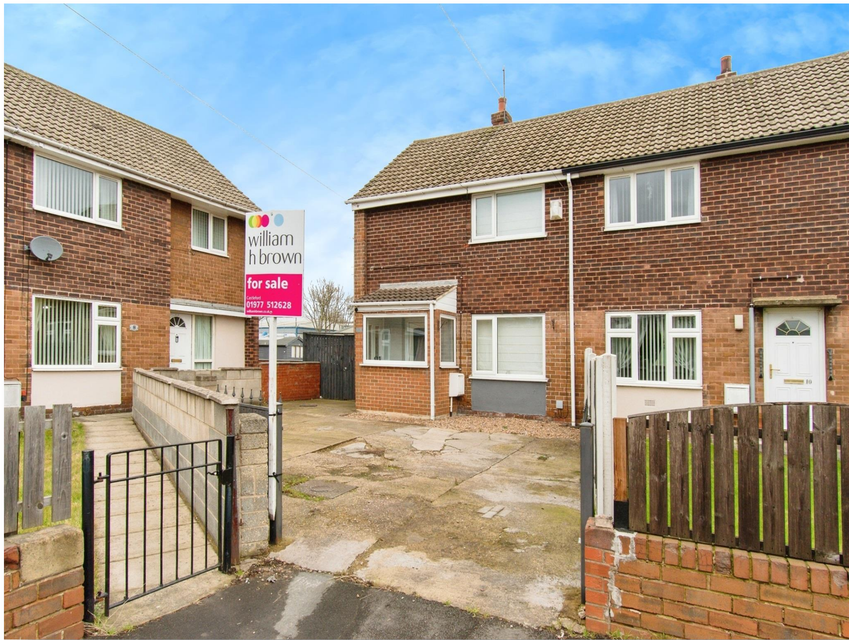
Waterloo Close, Castleford WF10 5PG