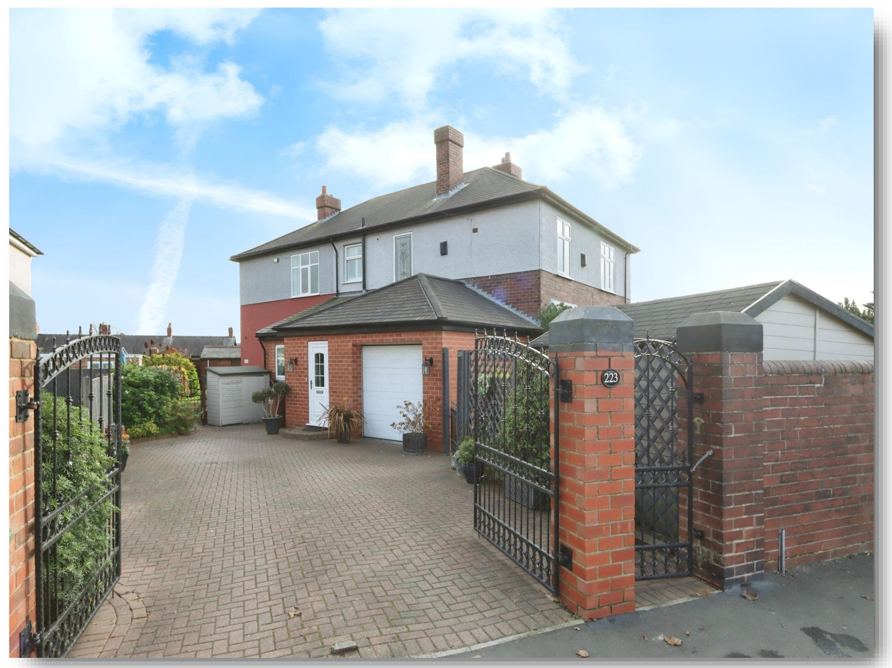
Wakefield Road, Normanton WF6 1BP