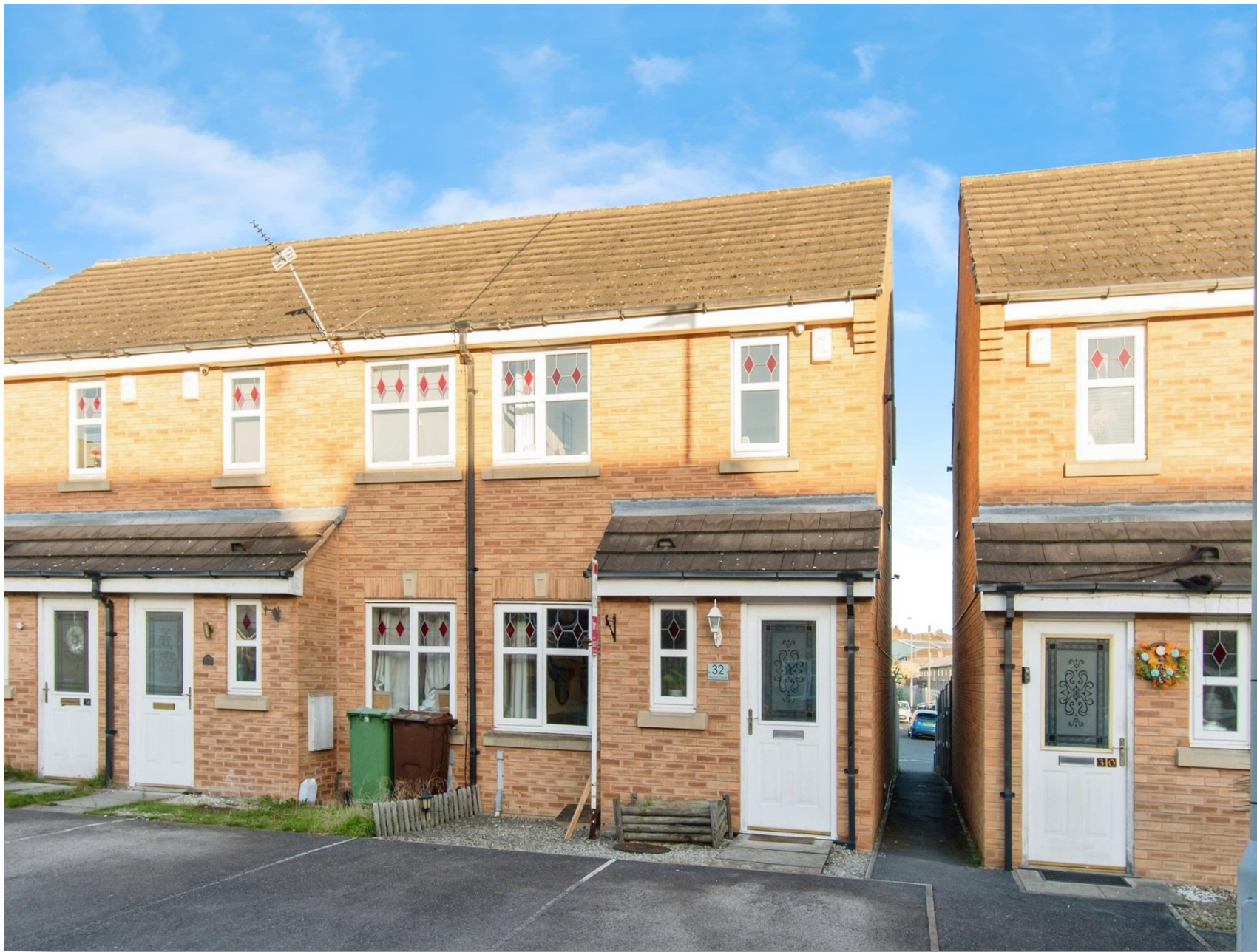
Hoctun Close, Castleford WF10 4TF