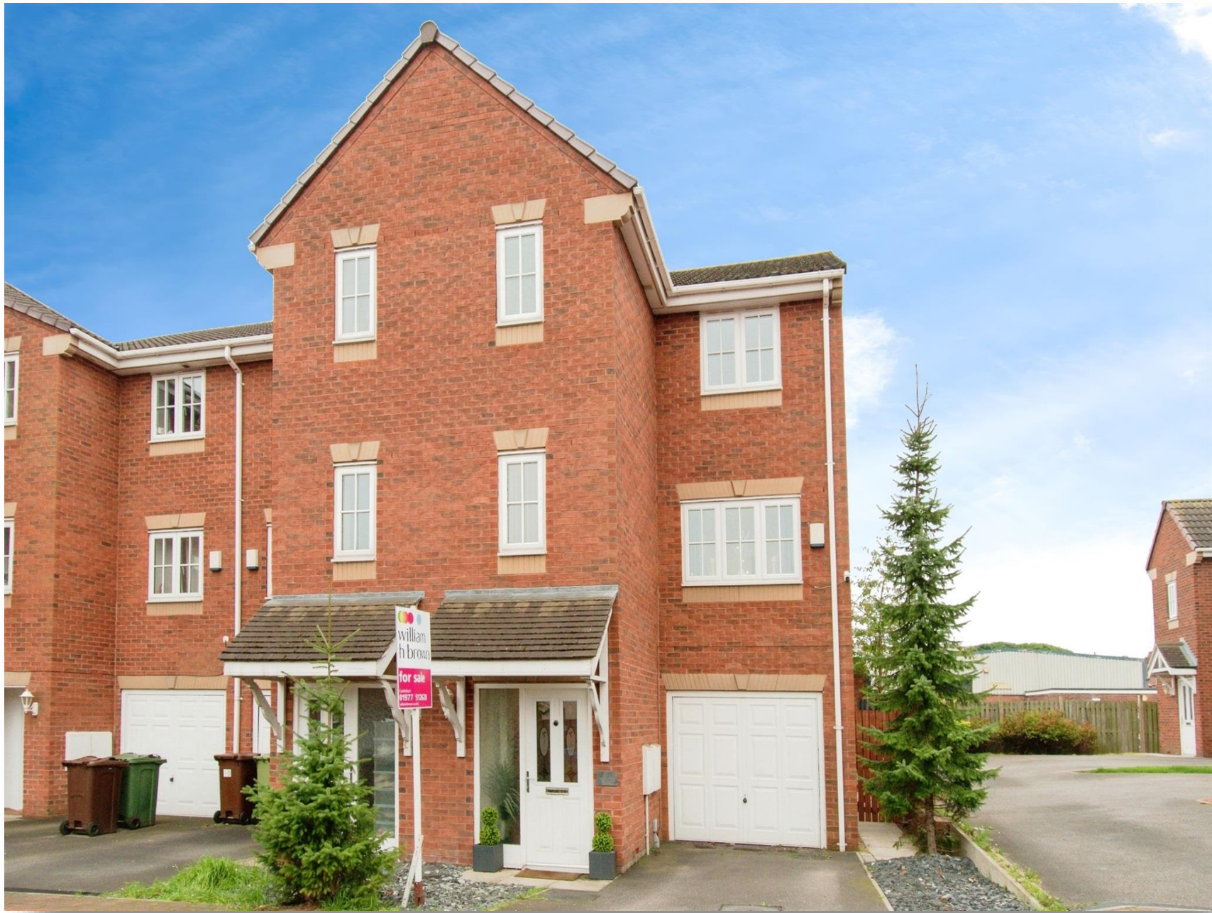
Waterford Place, Normanton WF6 1RJ