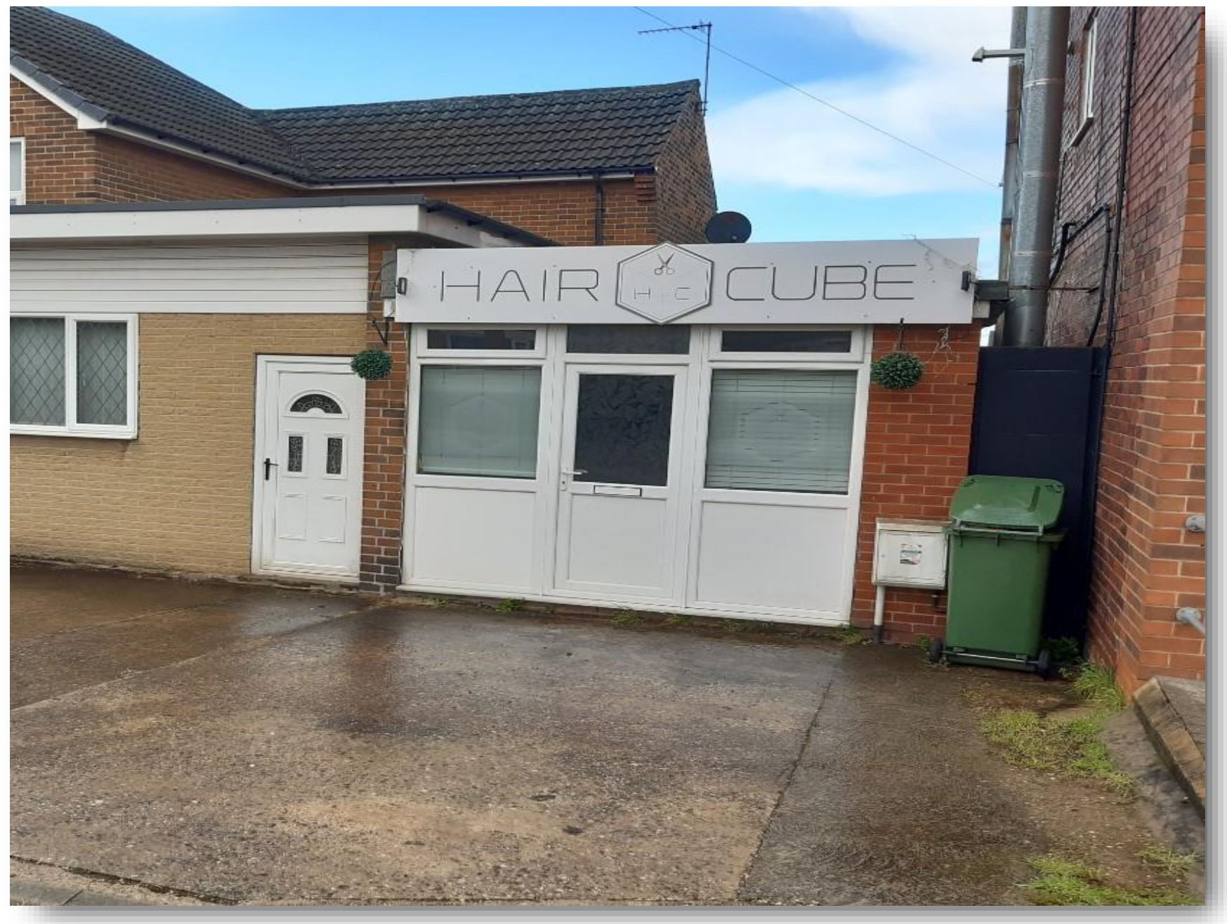
Pontefract Road, Ferrybridge Knottingley WF11 8PW