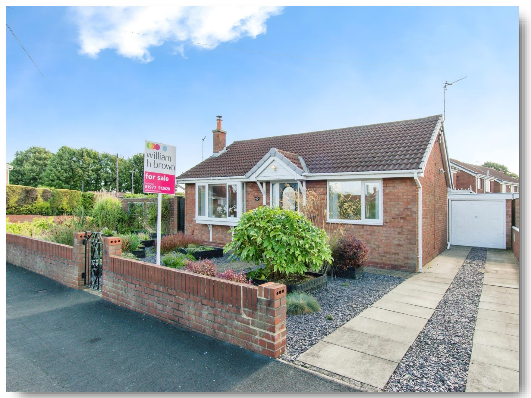
Mayors Walk, CASTLEFORD WF10 3QY