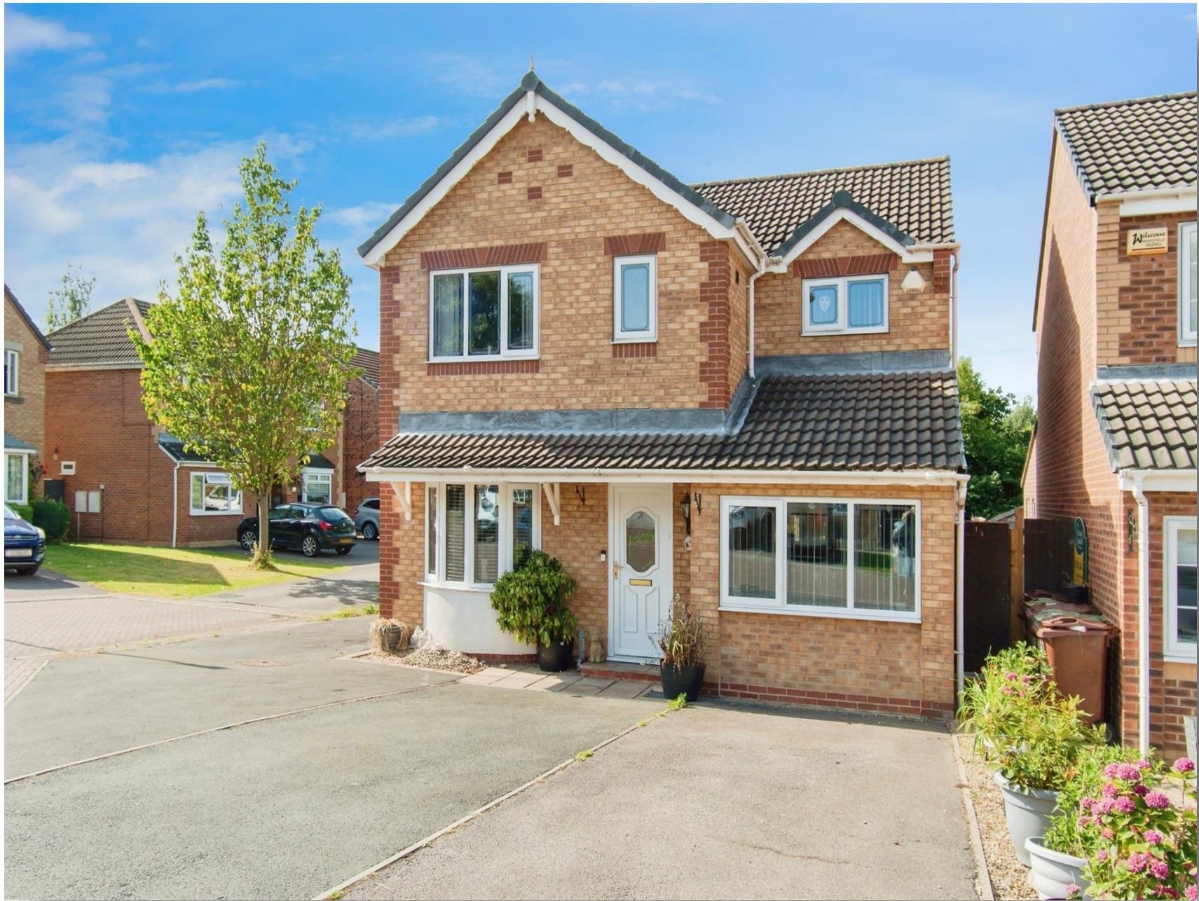
Beverley Close, Normanton WF6 1BU