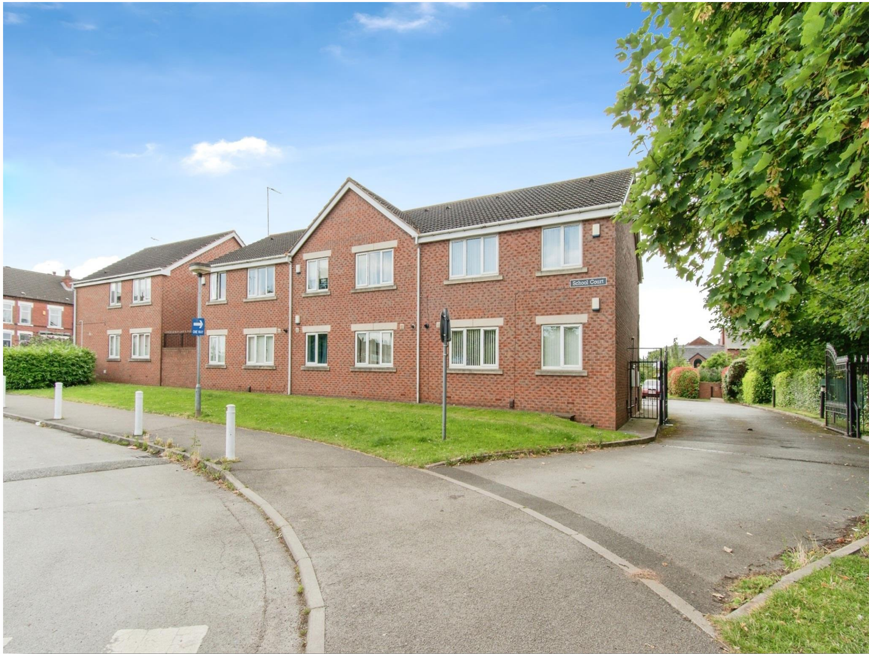
School Court, NORMANTON WF6 1QF