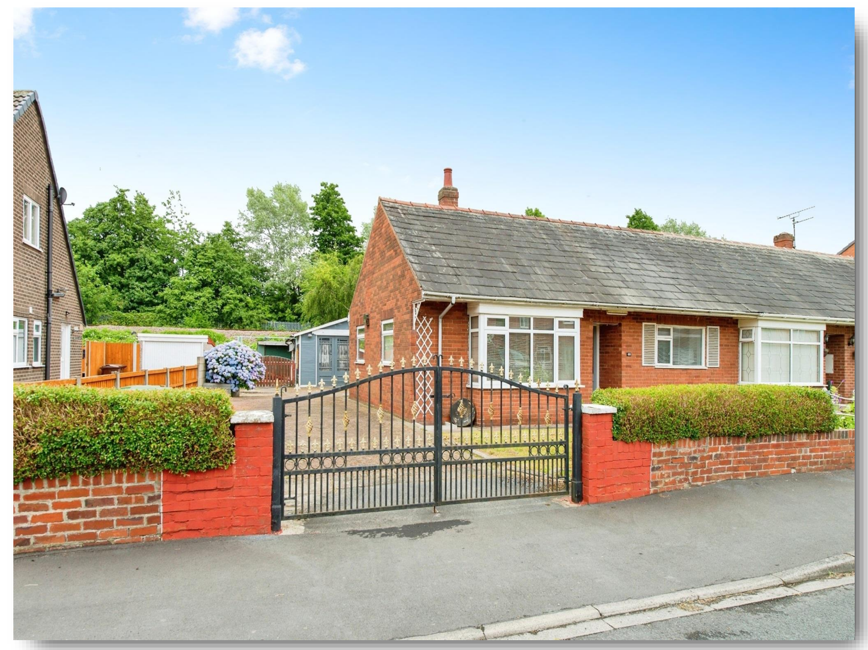
Hemsby Road, Castleford WF10 5ED