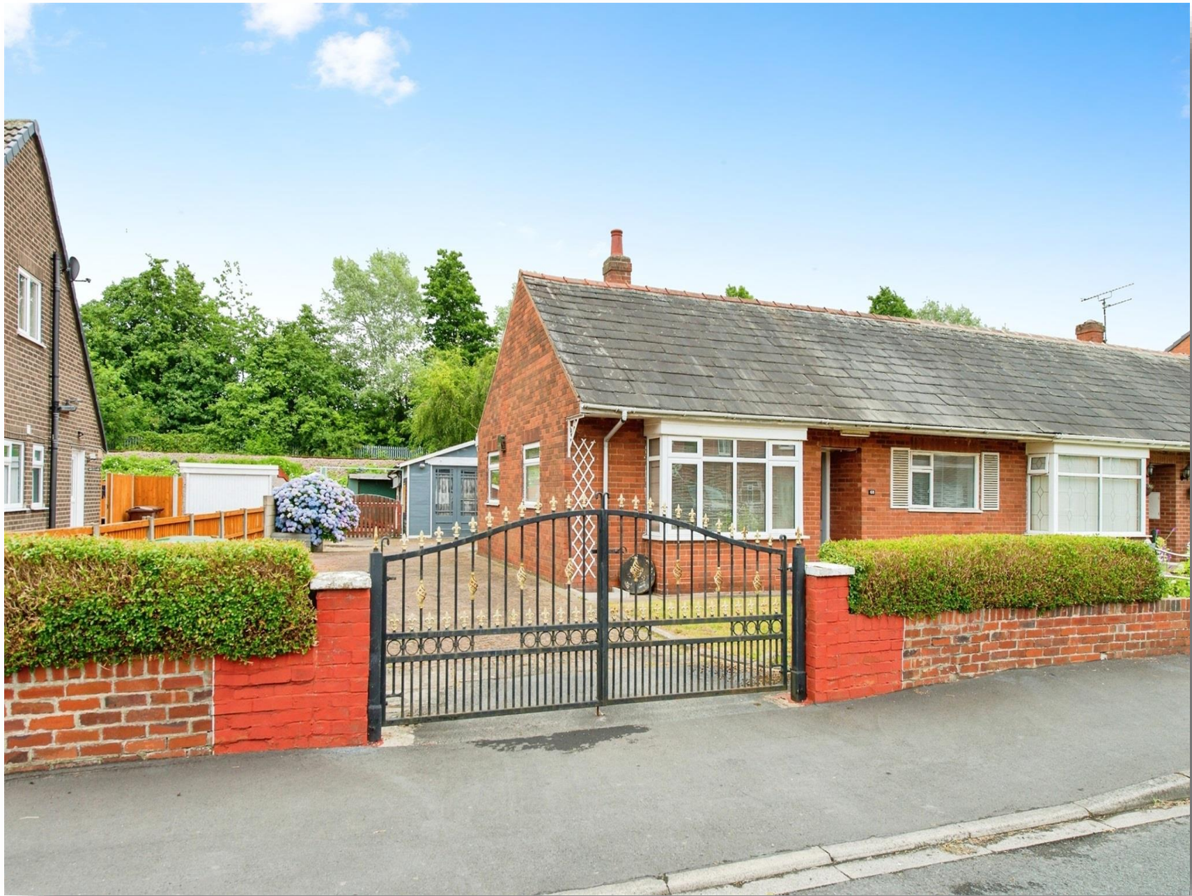
Hemsby Road, Castleford WF10 5ED