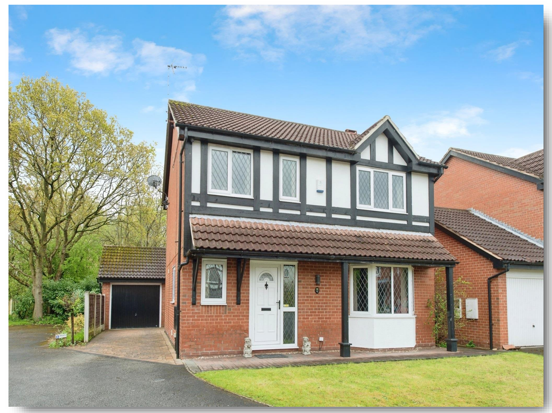
Pinders Green Drive, Methley Leeds LS26 9BA