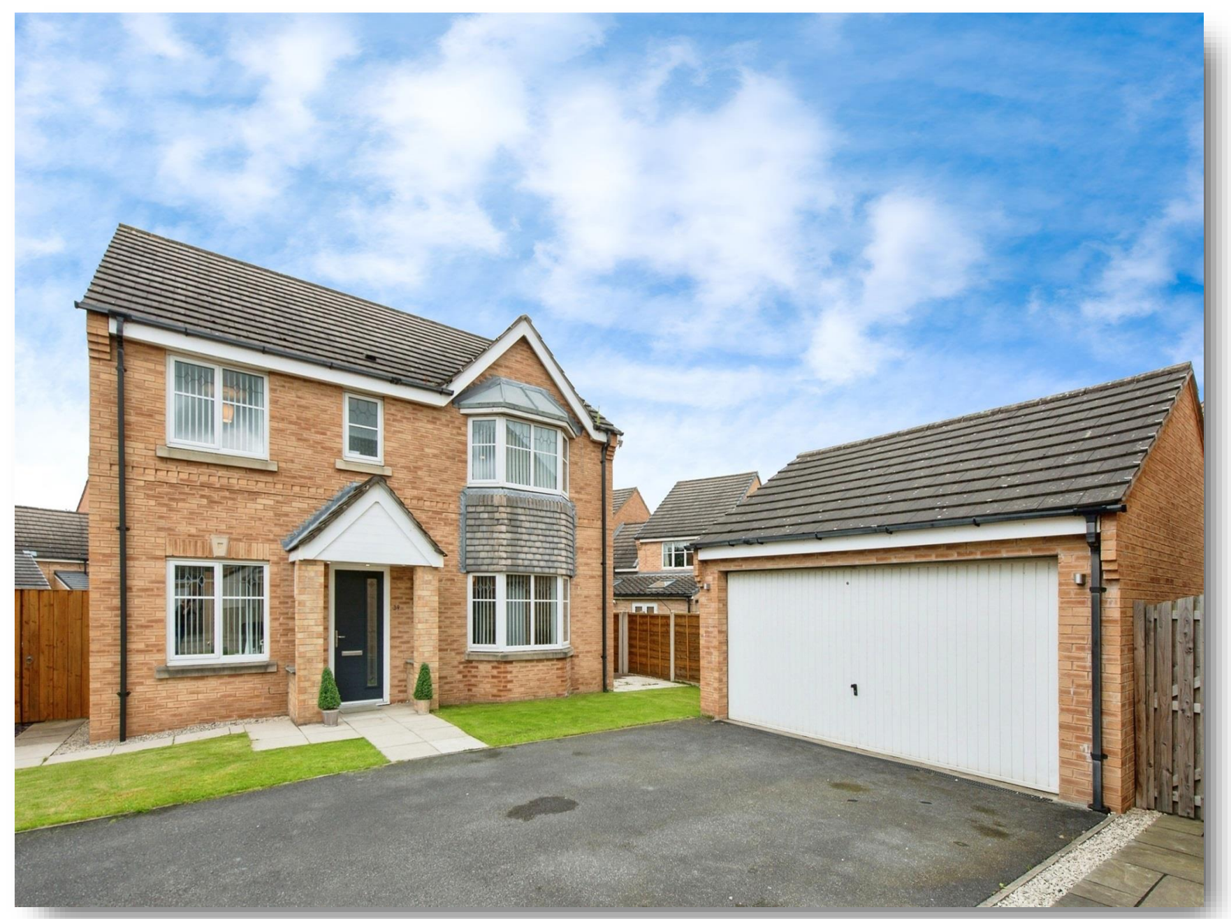
Kingston Drive, NORMANTON WF6 1TS