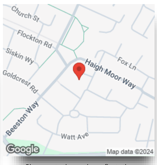
Please note the marker reflects the postcode not the actual property