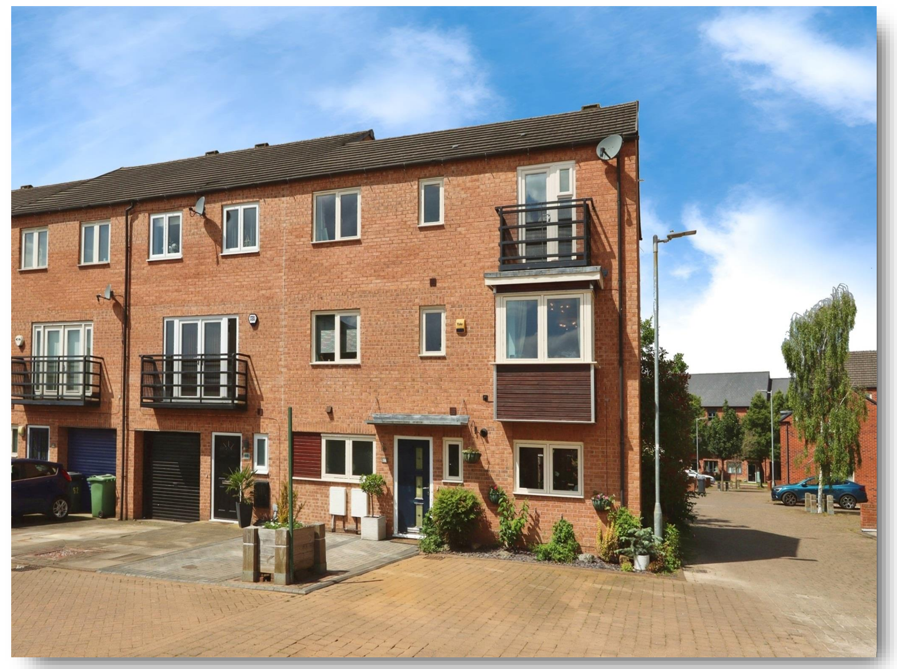
Warren House Road, Allerton Bywater Castleford WF10 2FB