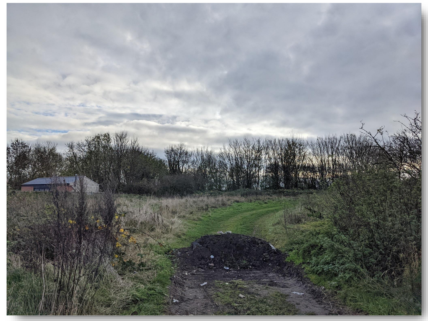
2 Wheldale Farm Cottages Wheldon Road, Castleford WF10 2PJ