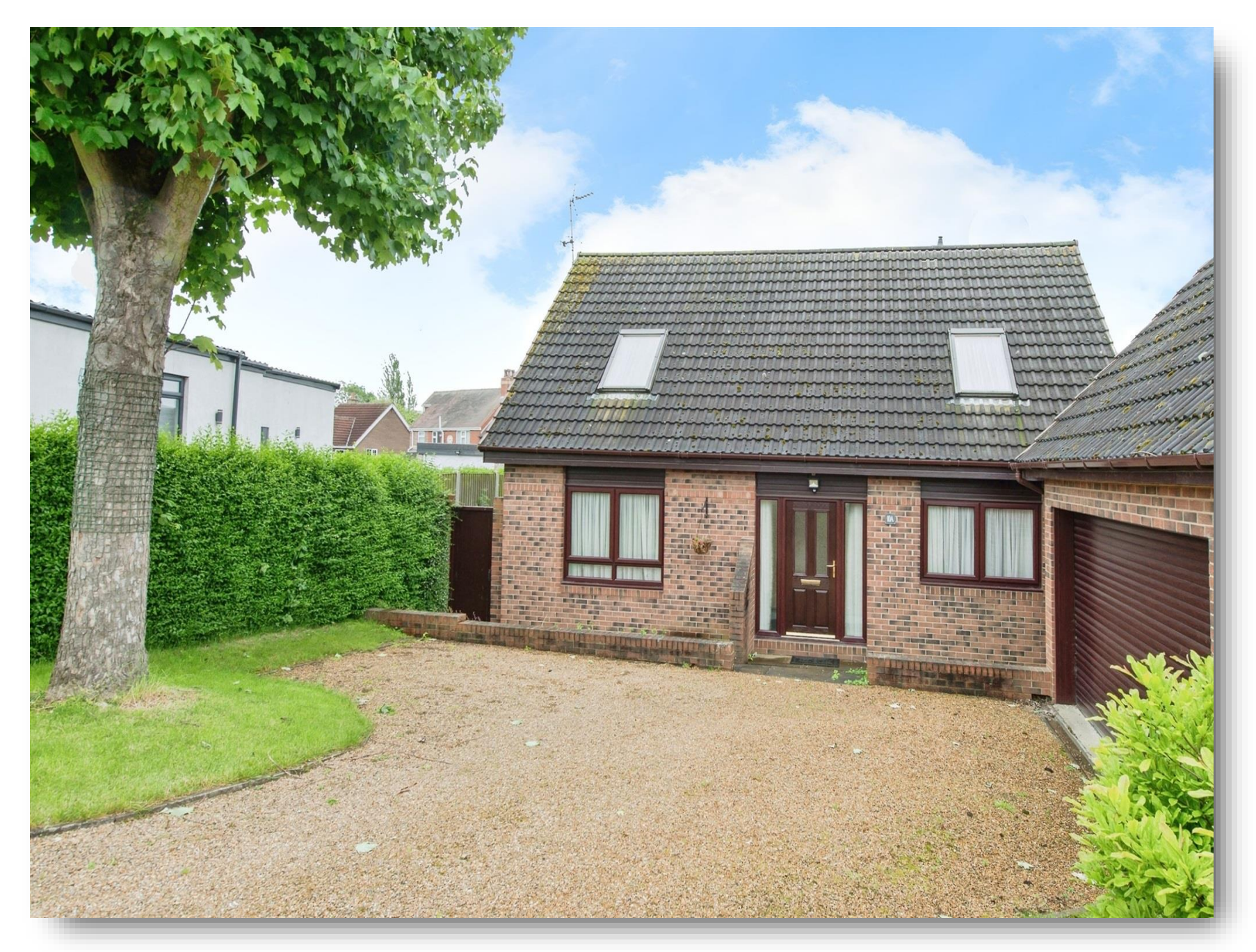
Hillcrest Drive, Castleford WF10 3QW