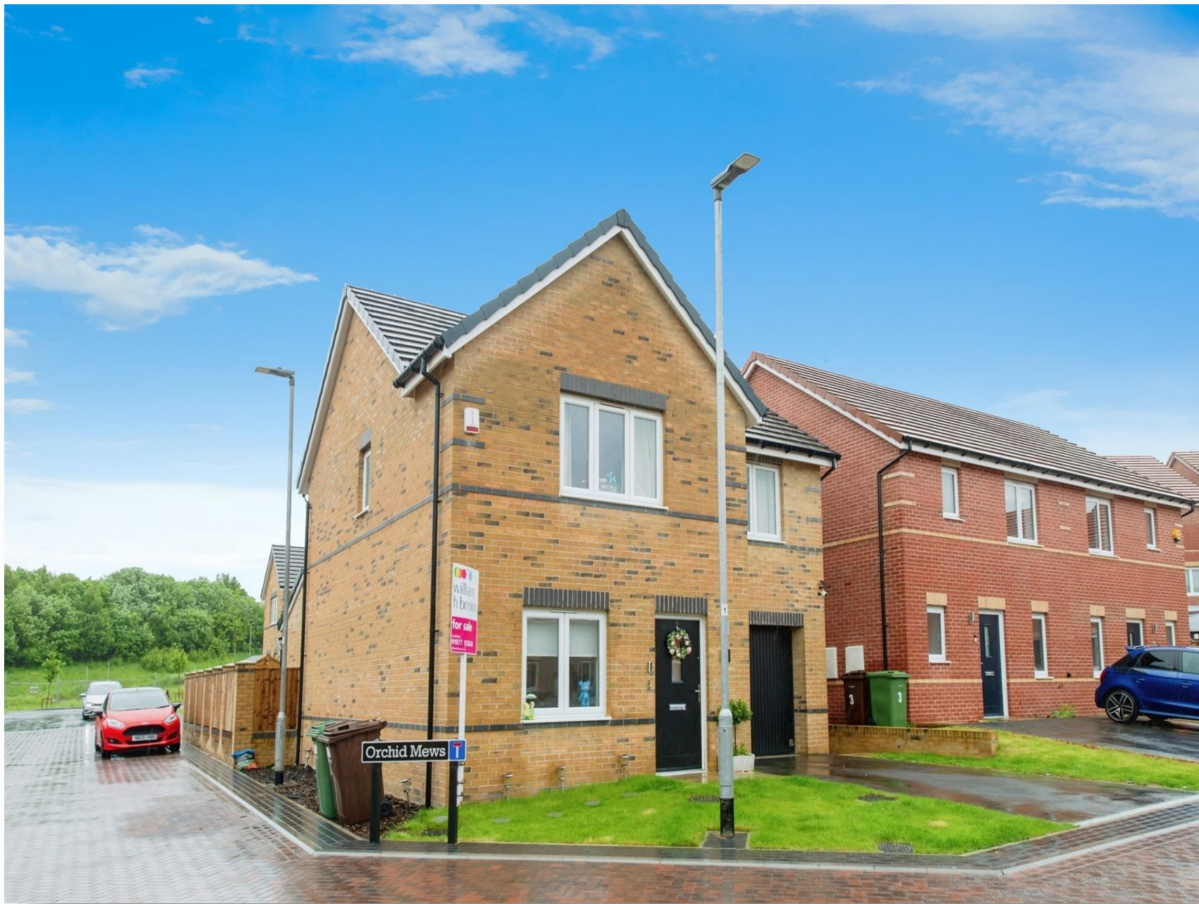
Orchid Mews, Castleford WF10 5ZQ