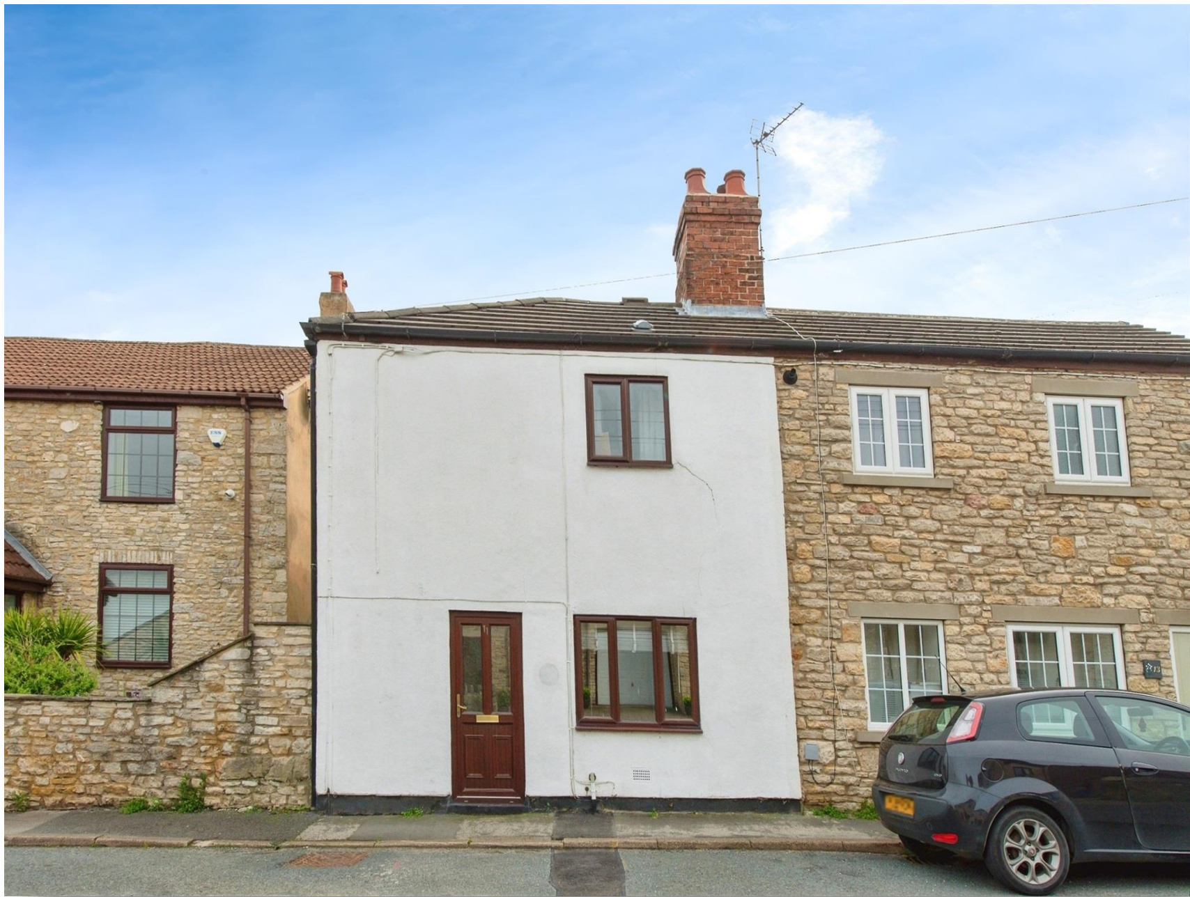
Silver Street, Fairburn KNOTTINGLEY WF11 9JA