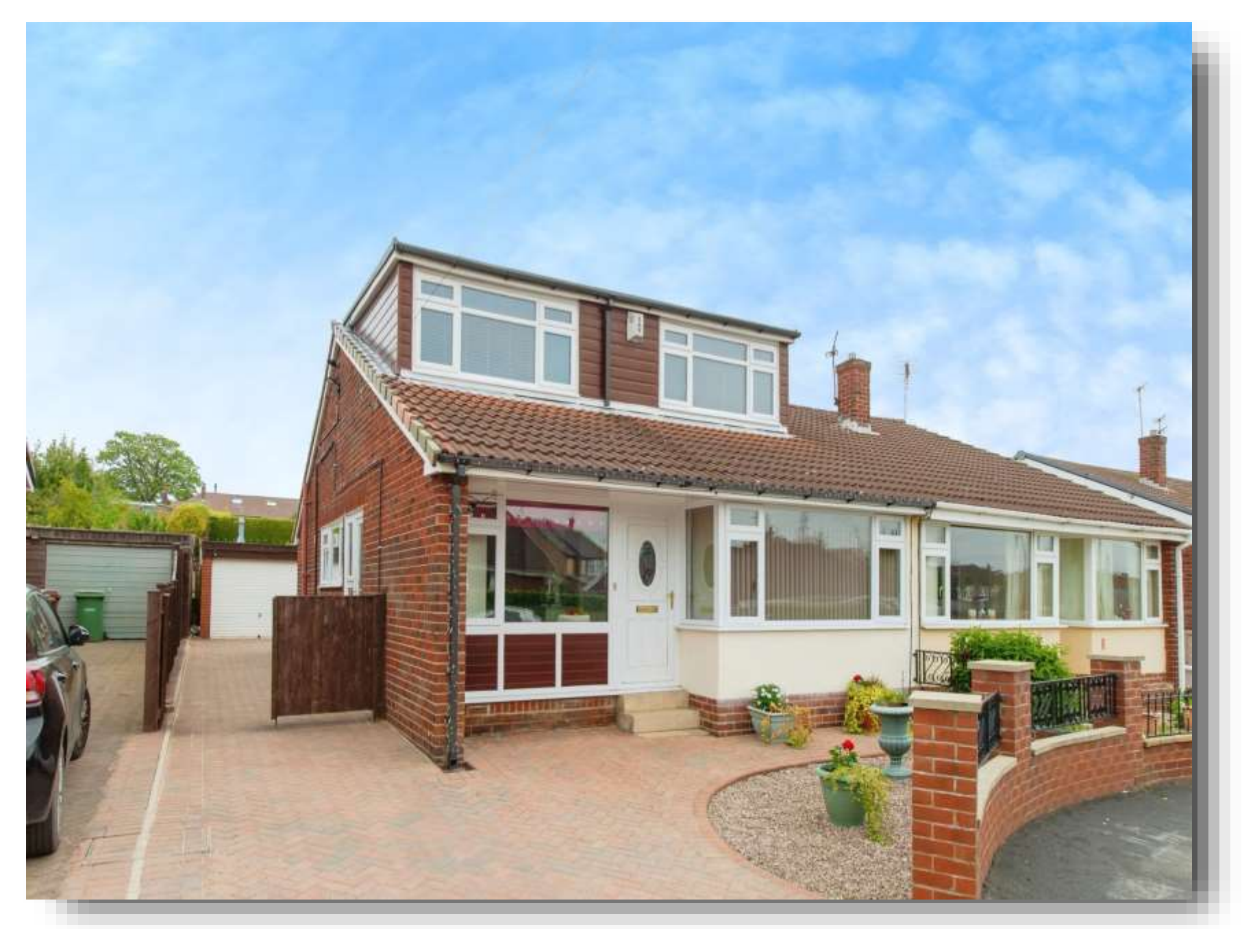
Acacia Close, Castleford WF10 3PG