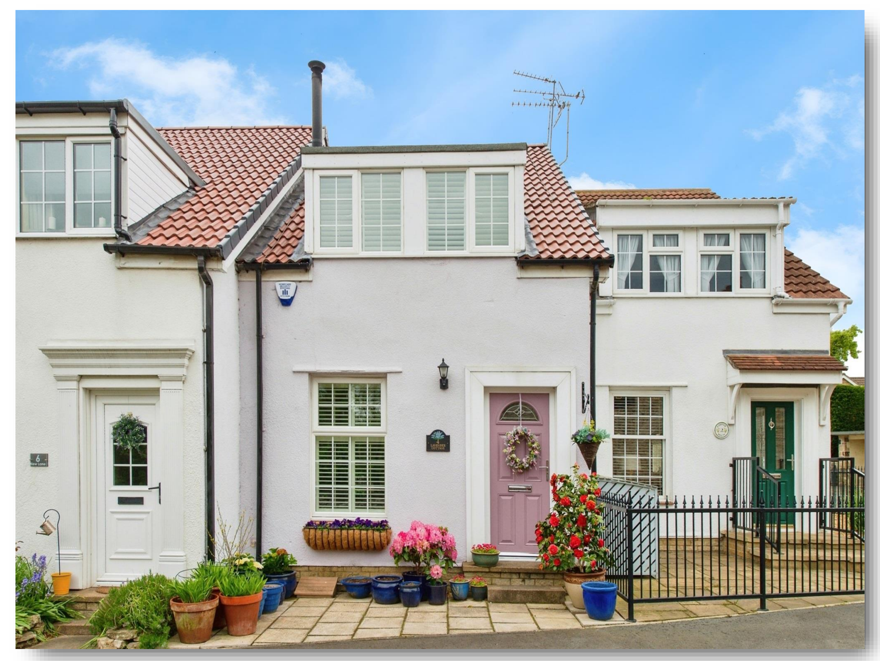
New Lane, Burton Salmon Leeds LS25 5JR