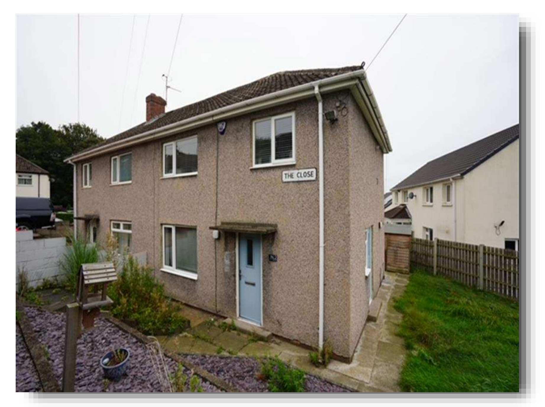
The Close, Kippax Leeds LS25 7NB