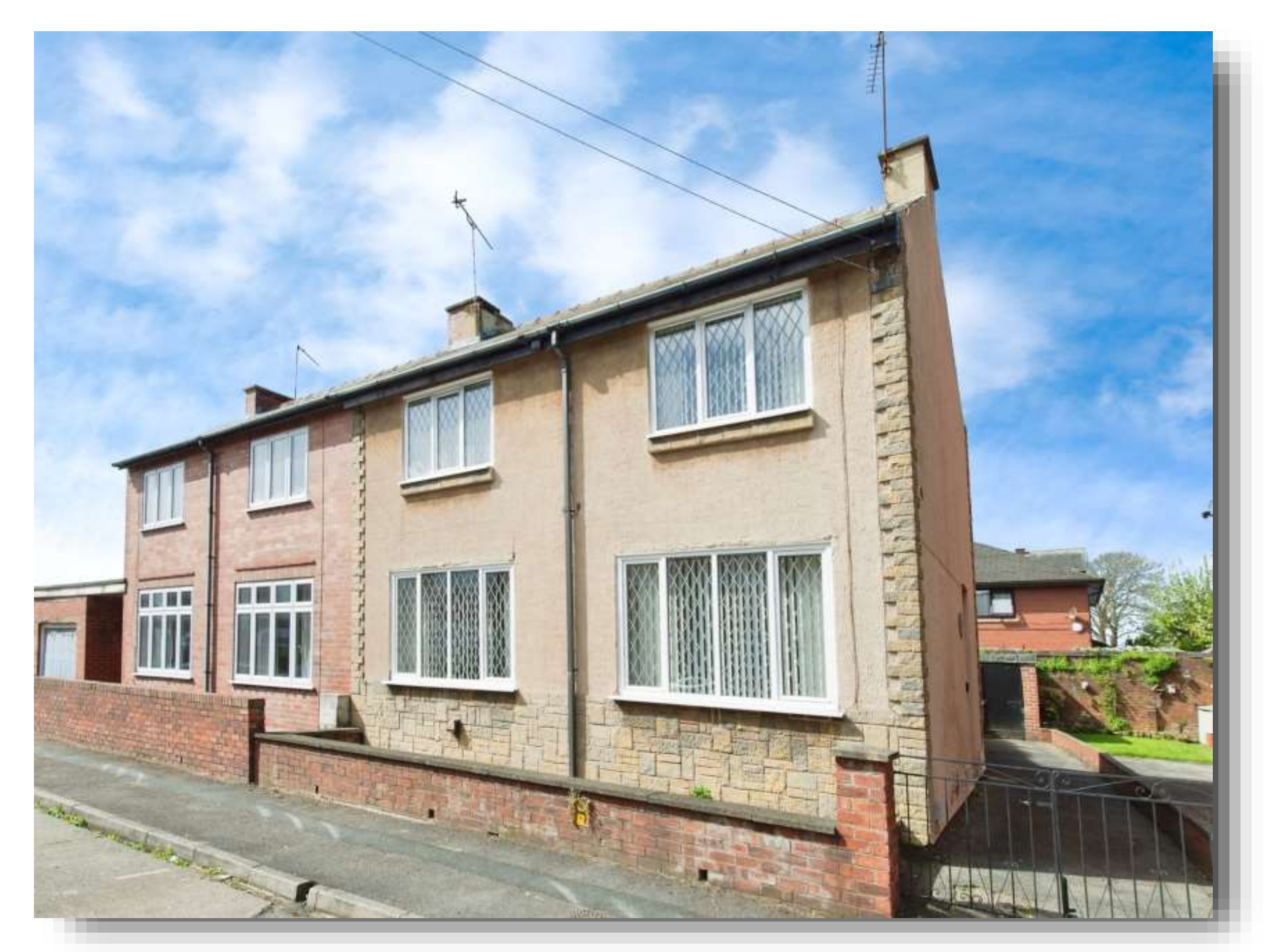
Longacre, Castleford WF10 5AH