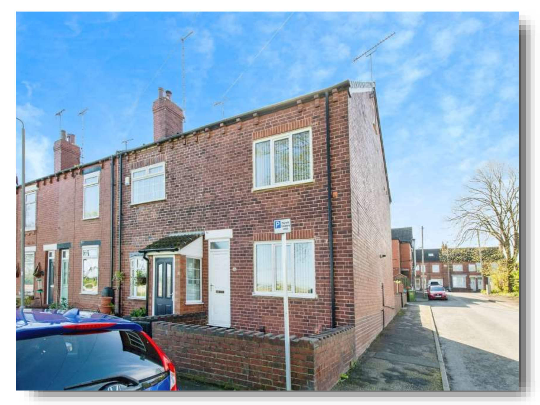
Norwood Street, NORMANTON WF6 1RB