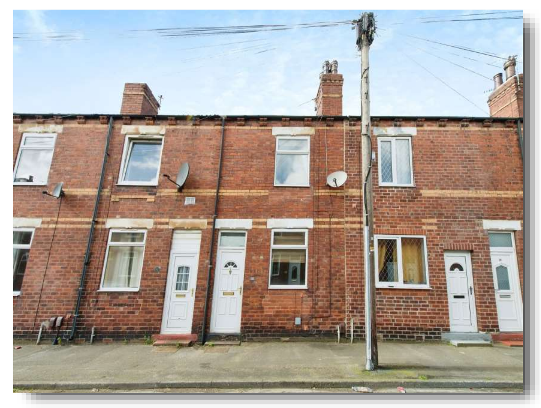
Granville Street, Castleford WF10 5HF