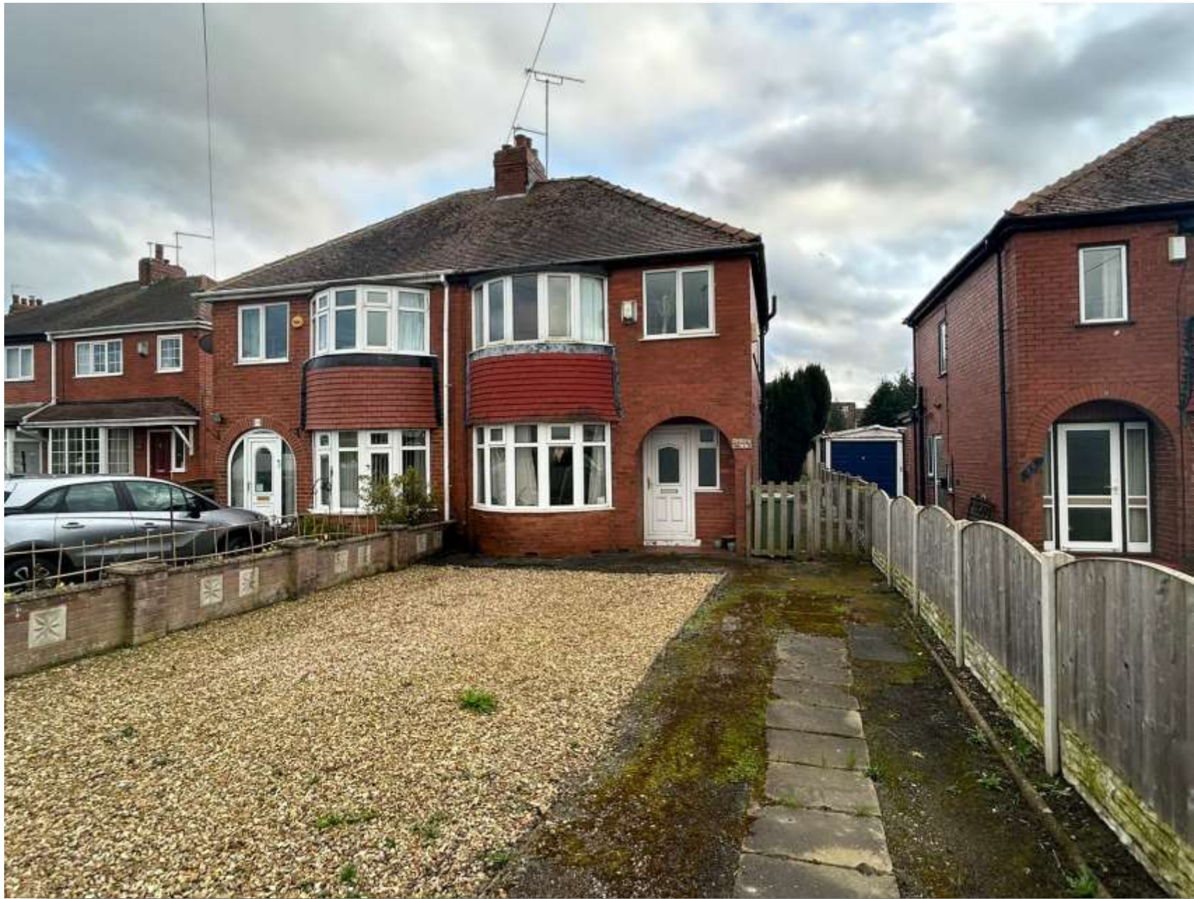
Park Lane, Allerton Bywater CASTLEFORD WF10 2AP