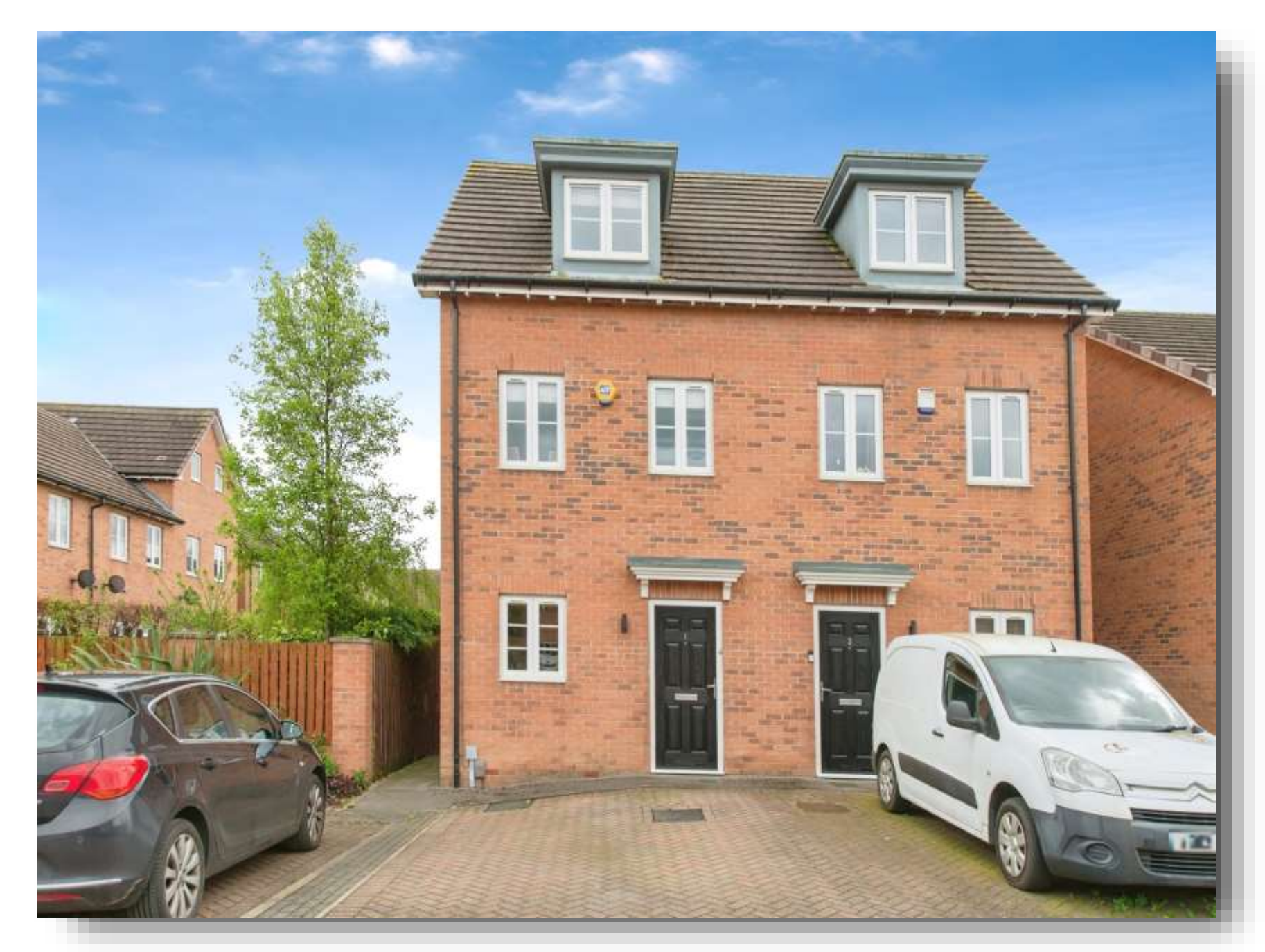
Ashley Mews, Castleford WF10 1BQ