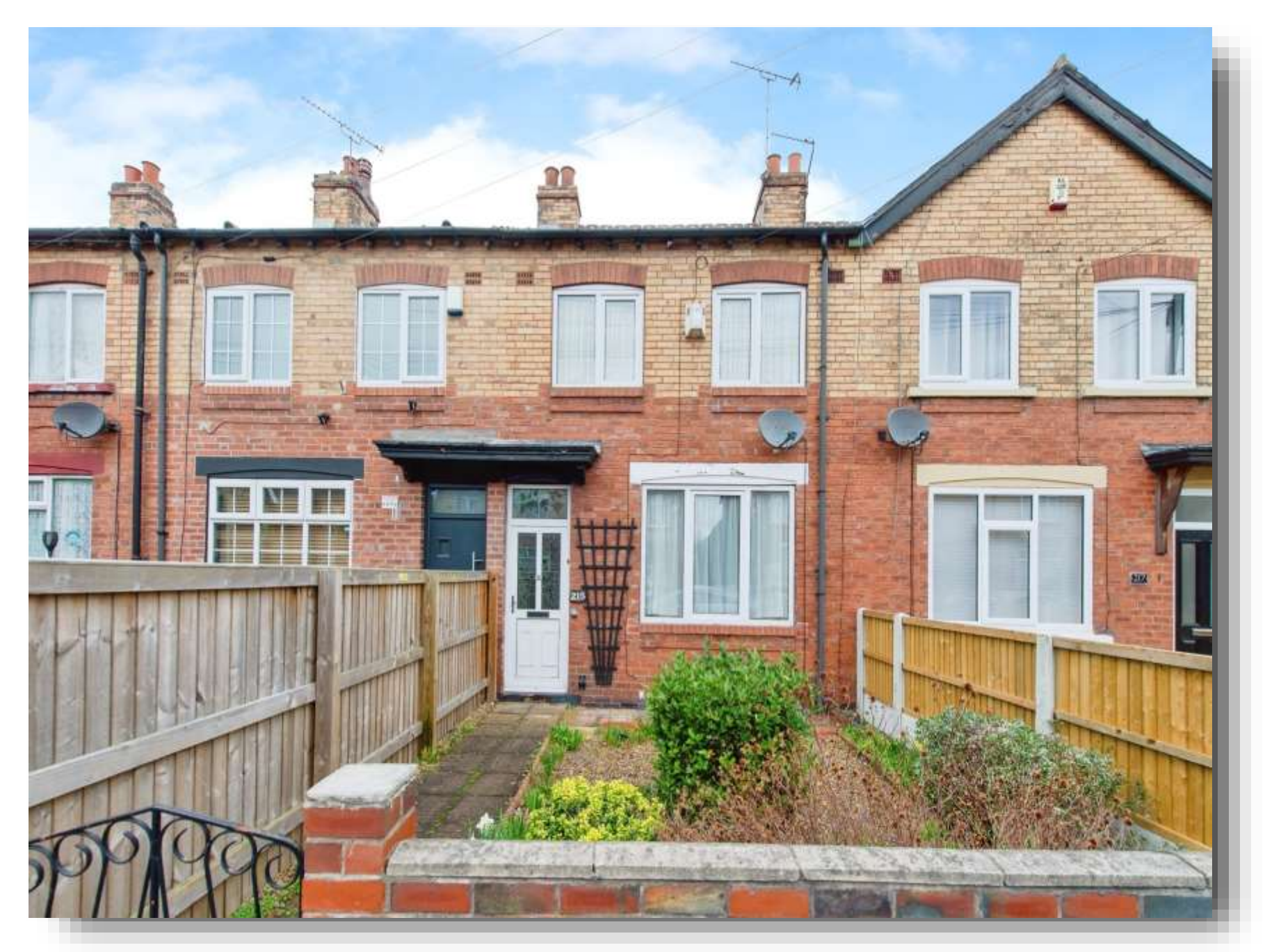
Smawthorne Lane, Castleford WF10 4ET