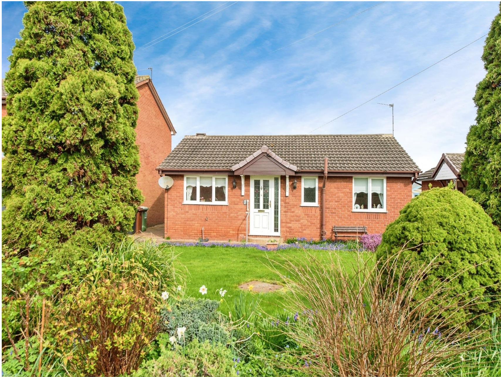
Lower Mickletown, Methley Leeds LS26 9AN