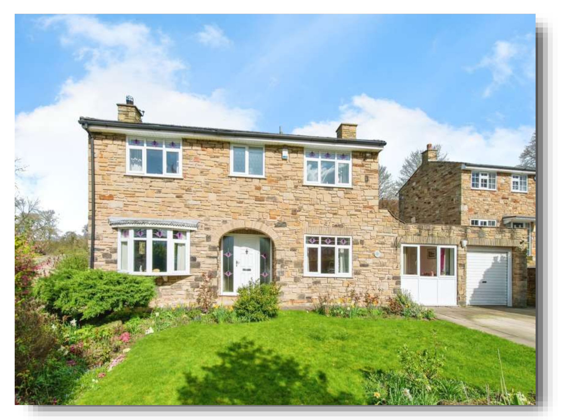
Dovecote Drive, Ledston Castleford WF10 2BA