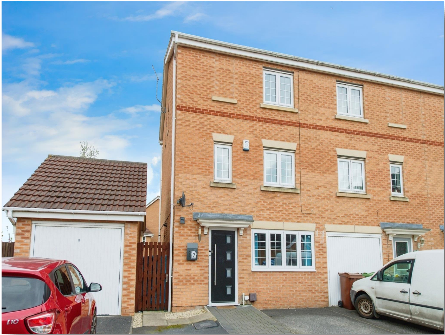
Millers Croft, Castleford WF10 5LP